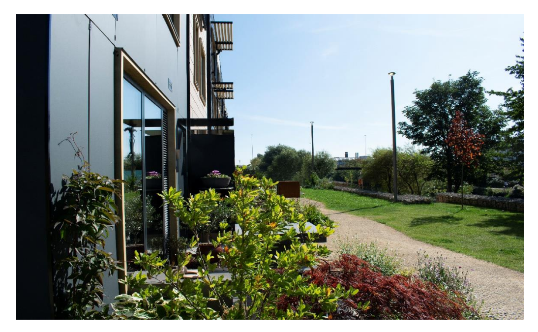
Secret Garden looking to the Willows