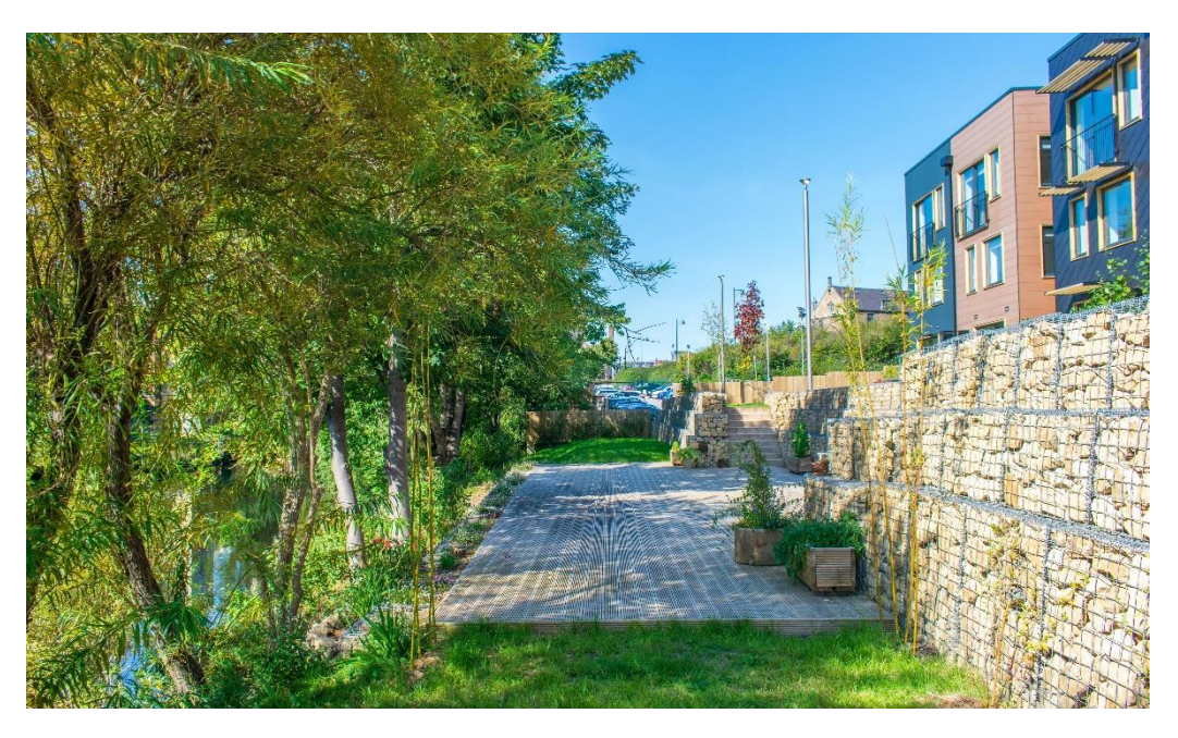
Flood and drainage measures along the river