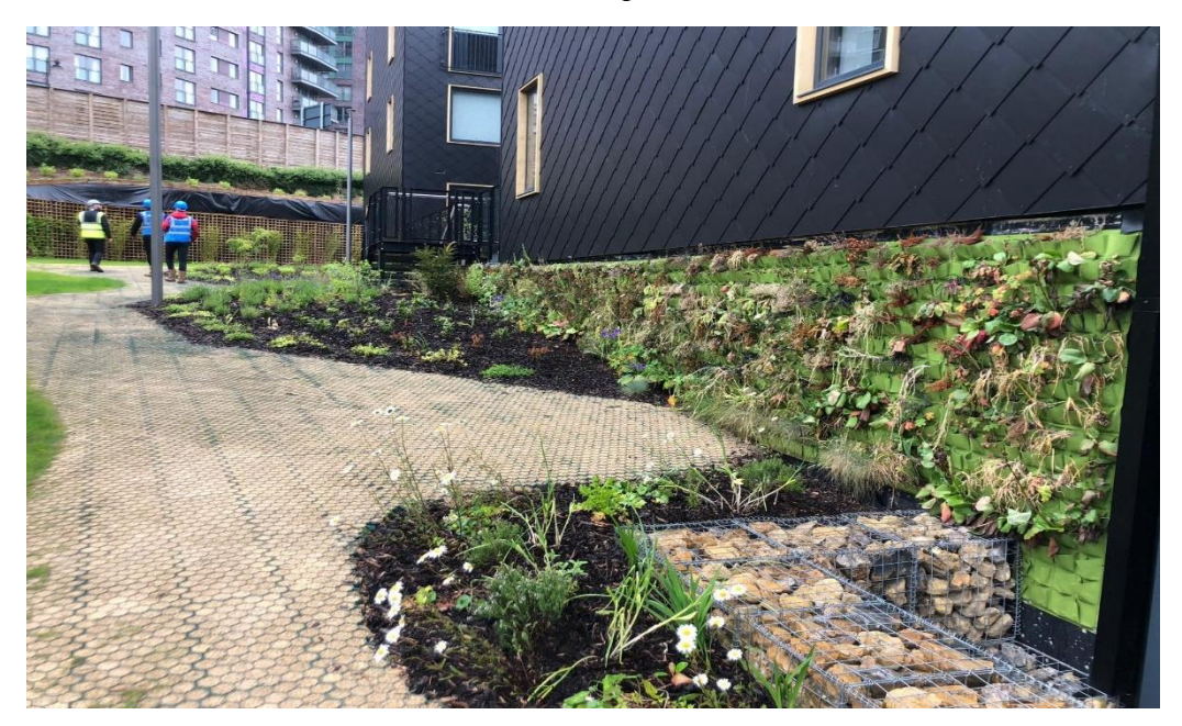
Creation of the Rain Gardens