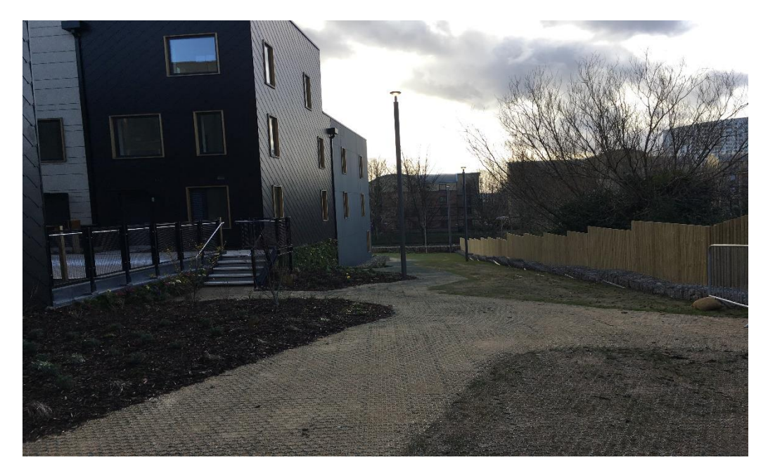
Early site photos of the urban landscape construction