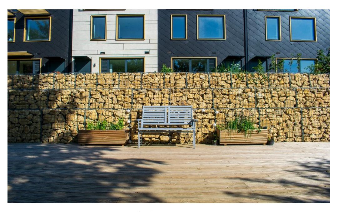
Gabion Baskets for flood prevention along the river