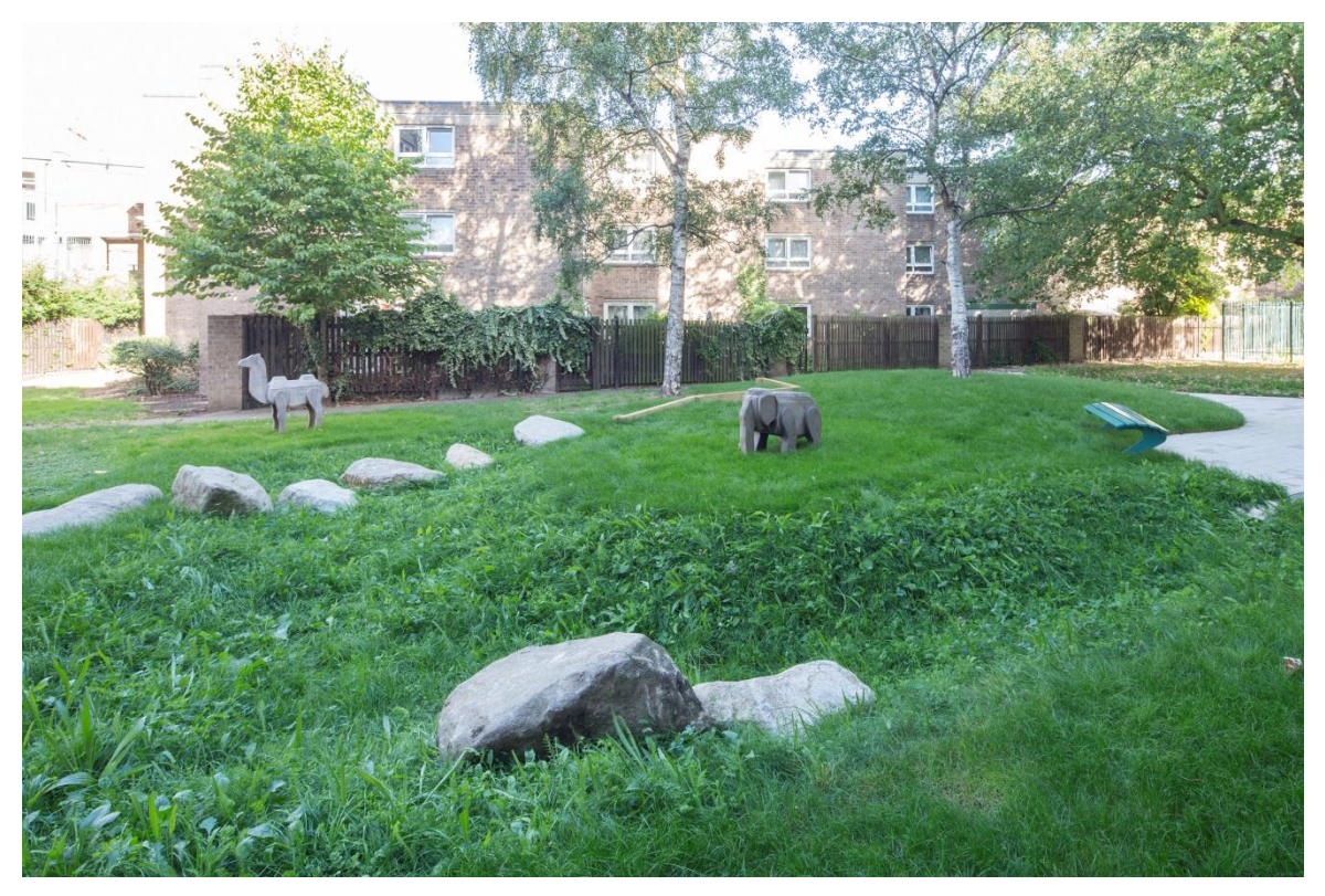
Fig 4 Orchard Square, Cheesemans Terrace, shallow meadow basins with informal play