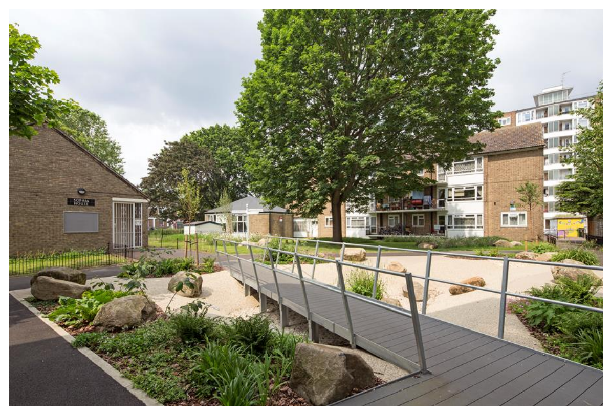
Fig 5 Queen Caroline Schotterasen gravel garden, adjacent to Adella House, and permeable paving and composite deck