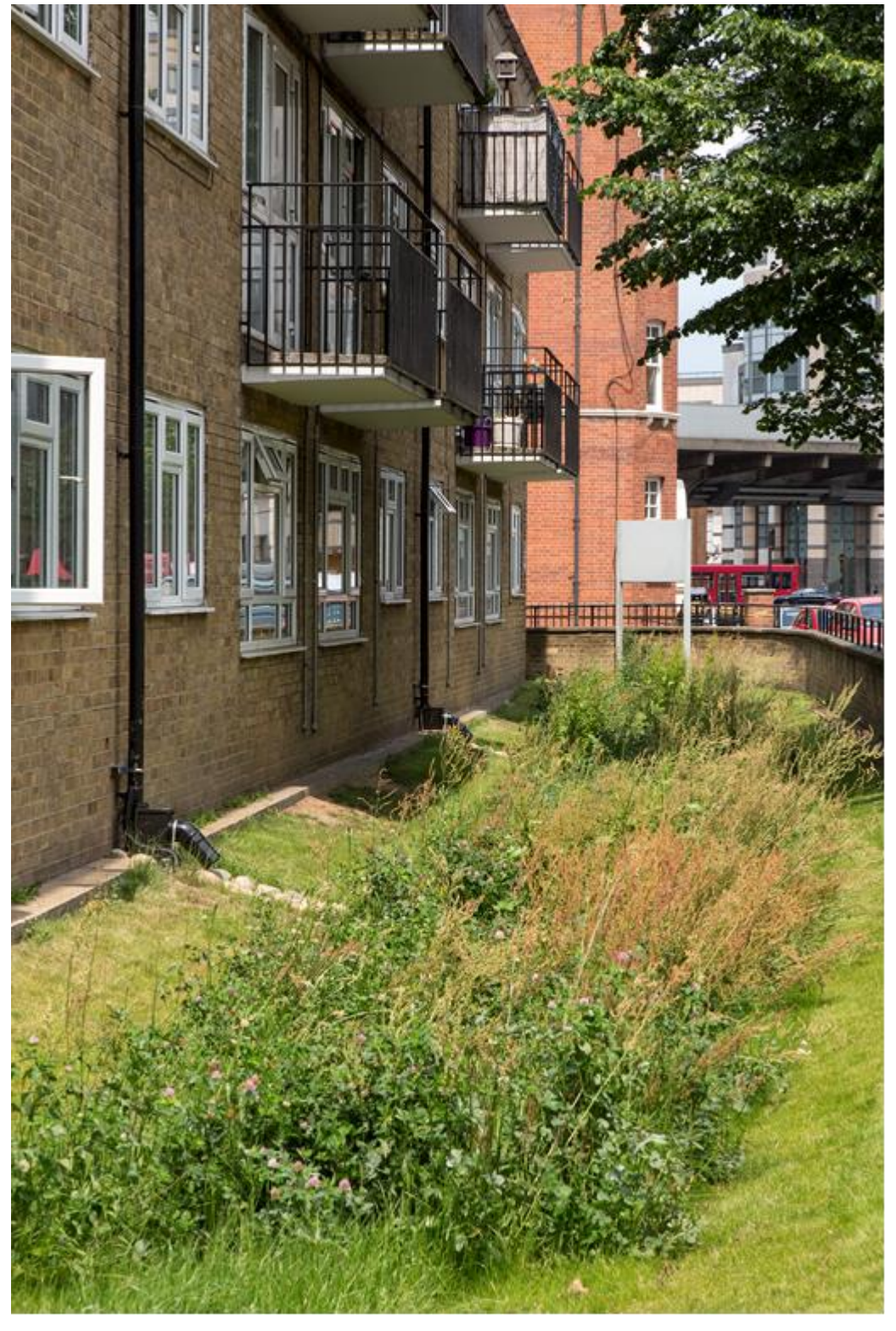
Fig 6 Queen Caroline Swale and pebble channel to down pipes