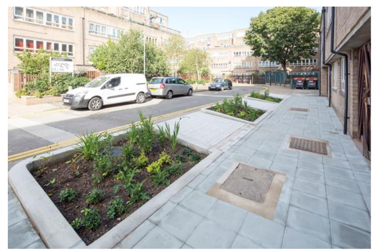
Fig 7 Sun Road, Cheesemans Terrace, rain gardens