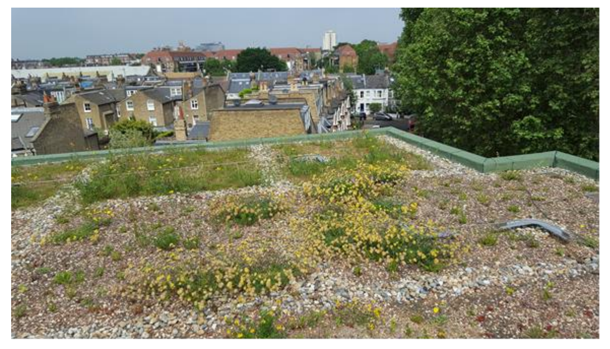
Fig 8 Richard Knight biodiverse extensive green roof