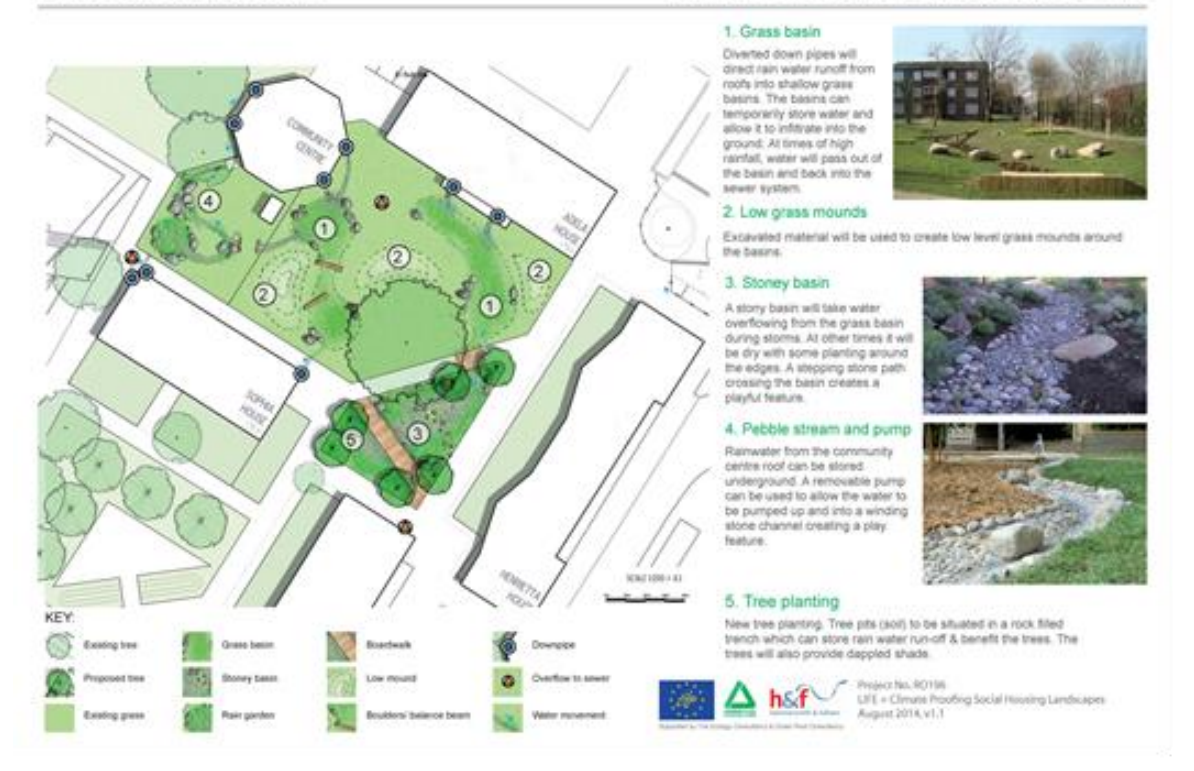
Fig 1 Queen Caroline drainage rationale for consultation