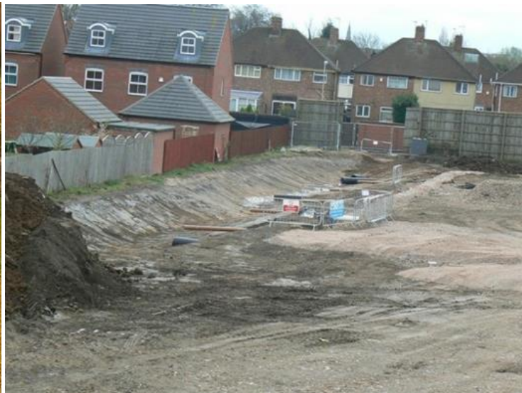
Fig 5. Creating the 'wobbly' swale