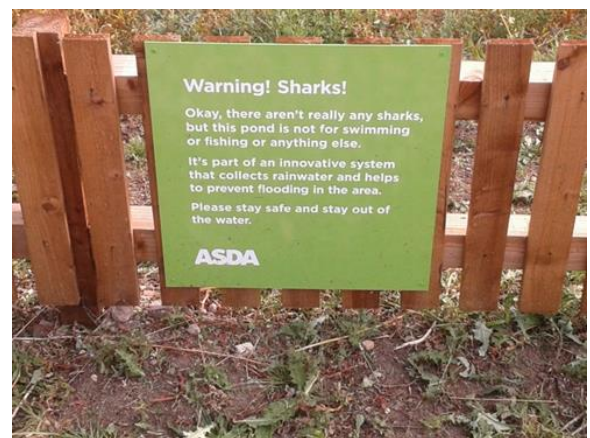
Fig 10: Signs around the site