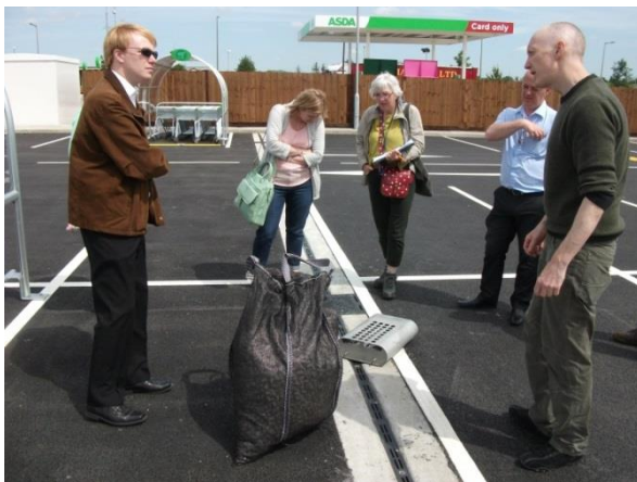
Fig 7: A gully guard