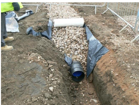
Fig 9: Installation of final filter drain