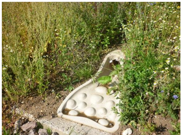
Fig 8: Swale outlet