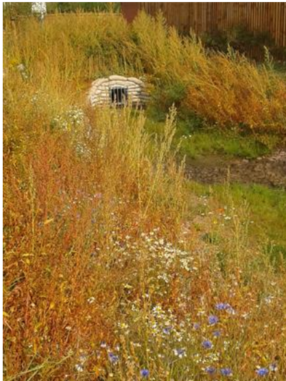
Fig 4. Headwall