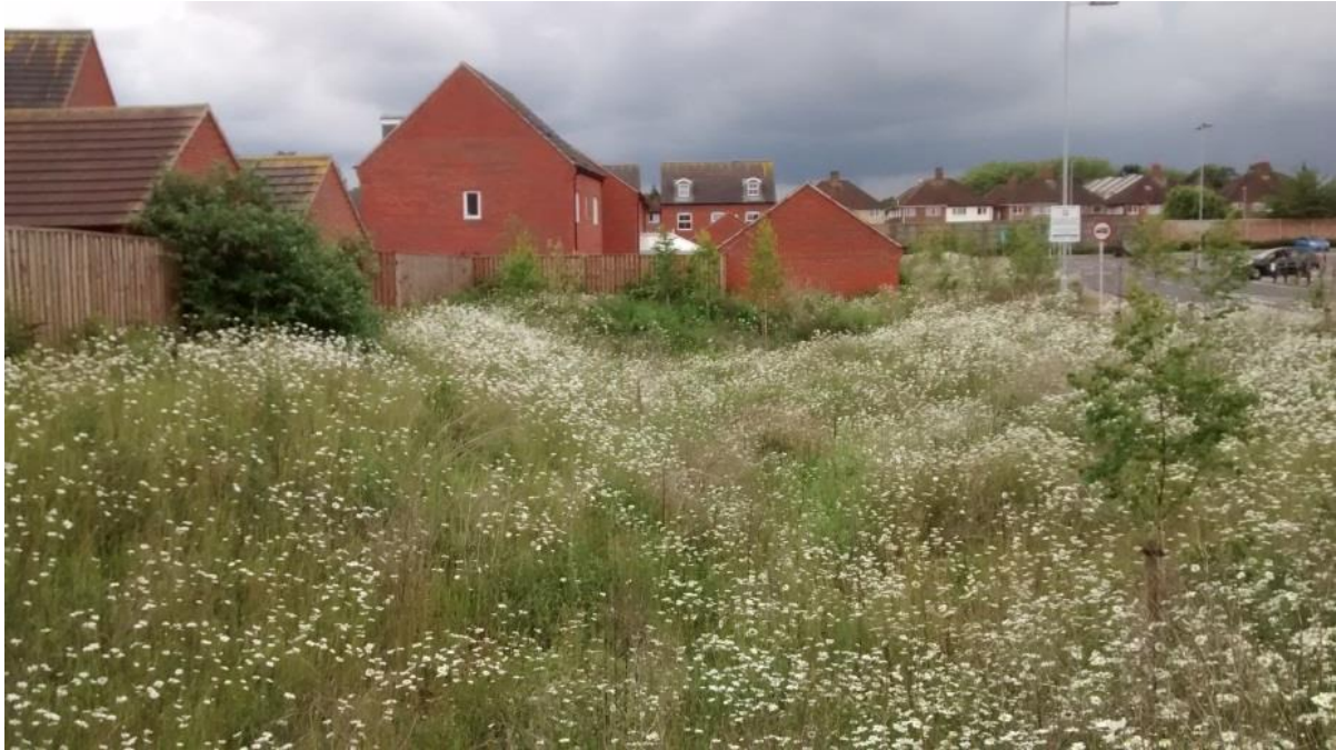
Fig 6: Meadow flowers in detention area and swale