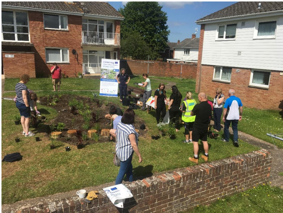
Figure 2 planting day - with tea and cake!