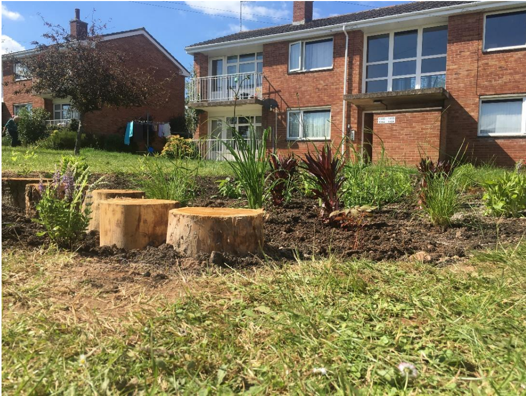
Figure 3 The rain garden 3 months on