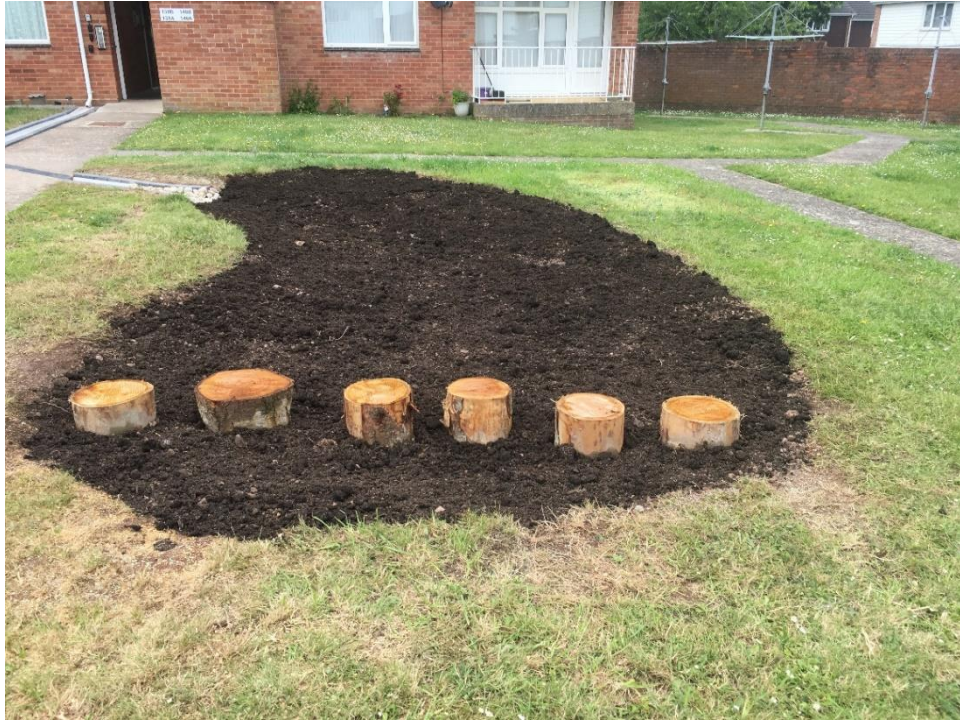
Figure 1 The bare bones- awaiting the residents to plant up and seating