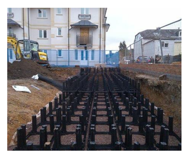
Figure 3 Buckland House Car Park construction phase (1)

Installation type: Integrated - Trees and stormwater soil cells: gully pots, attenuation tank, soakaway, gravel bed, permeable surfaces.