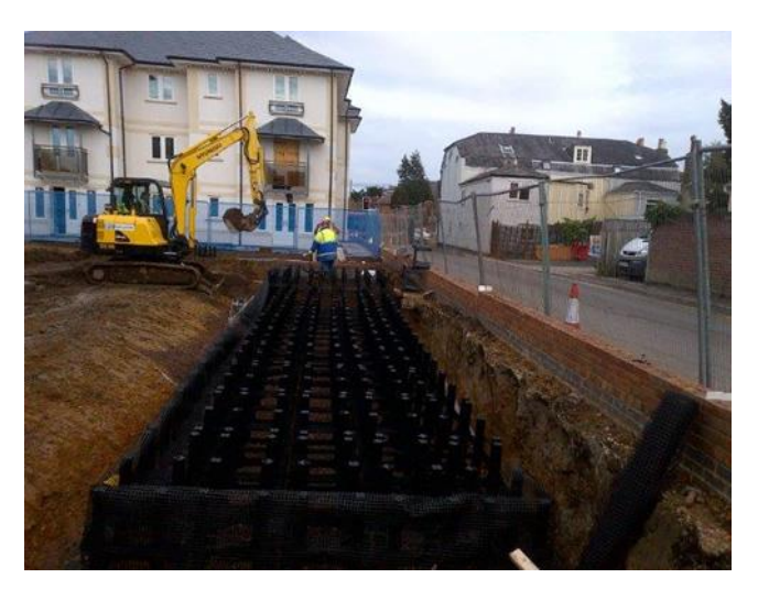
Figure 4 Buckland House Car Park construction phase (2)