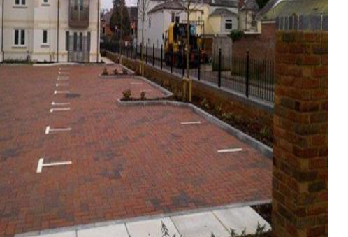
Figure 1 Buckland House Car Park (1)