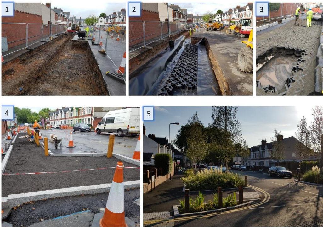
Figure 6 – Rain garden with below ground tree root cells during construction