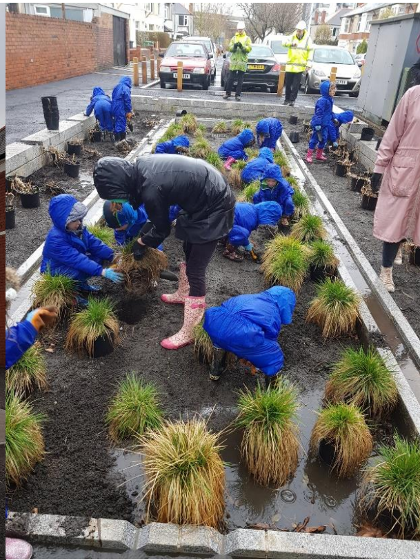
Figure 5 - School planting event

Community engagement was at the heart of Greener Grangetown. Having the community involvement during option selection and the design process and showing that their views were being listened to has helped achieve a key project objective in improving community pride. The community is diverse with 48 different languages spoken at a local primary school. Therefore different ways of communicating ideas such as school visits, indoor and outdoor community events used visualisations and drawings to help convey ideas and inform decisions. Engagement continued throughout construction with weekly drop-in sessions, planting events and updates through leaflets and social media. Key concerns from the community related to parking availability and the presence of litter in streets, which were then considered as part of the scheme. This resulted in increased residential parking allowances and more litter bins.