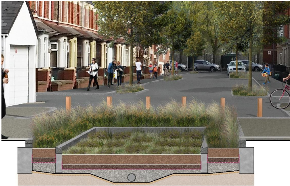
Figure 3 – Artistic impression of section through rain garden showing perforated pipe at the base Drainage is kept shallow wherever possible using recycled plastic composite kerb drainage and channel drainage units to convey flows from the busy Corporation Road into rain gardens located at existing dead ends of 7 of the streets. These create features within an improved public realm by adding green space to the area.

of contaminated made ground and impermeable material. All of the SuDS features are therefore lined with an impermeable liner, which also protects nearby buildings from the impacts of tree roots.