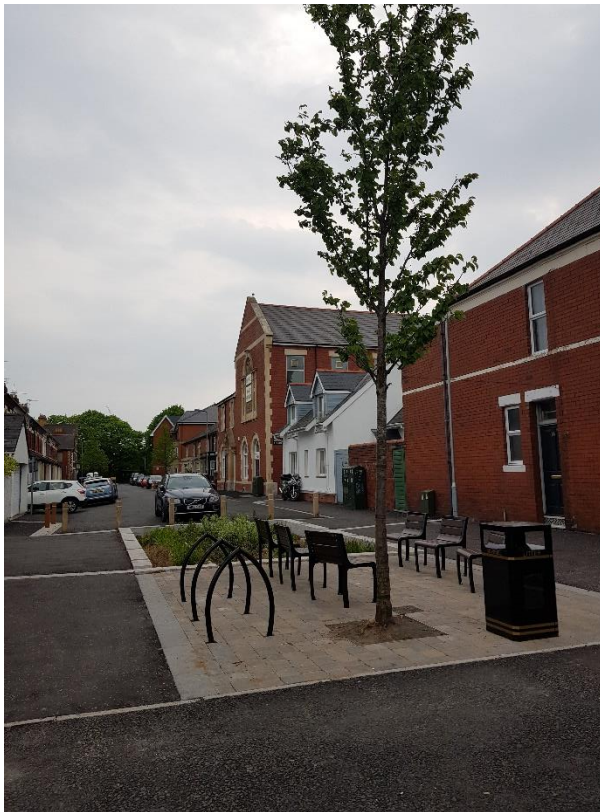
Figure 4 – Rain garden within regenerated public realm. Kerb and channel drainage keep water at the surface