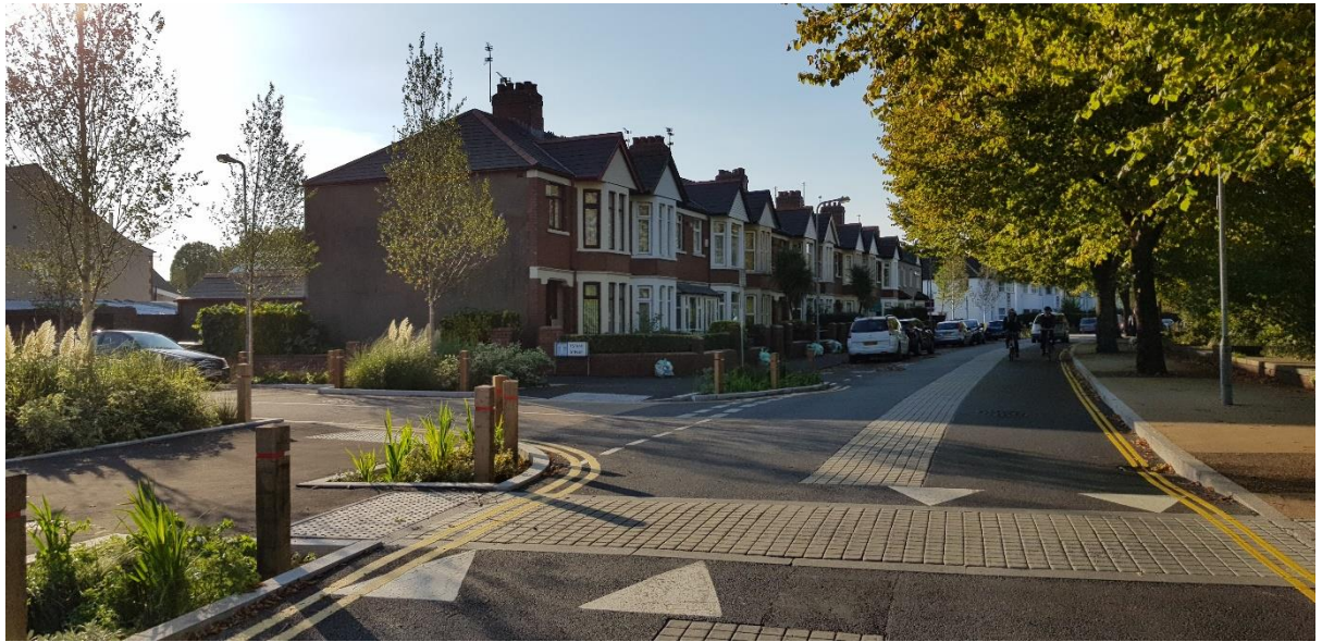
Figure 7 - Bicycle street, safer junction and widened pedestrian footpath along the Taff Trail

The benefits of the project were targeted during the feasibility stage. A Sustainable Project Appraisal Routine (SPeAR) assessment was carried out to identify where scope for improvement, including aspects such as outdoor experience, community pride and encouraging sustainable behaviours of the community.