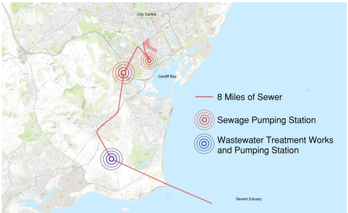
Figure 1 - Pre-construction unsustainable drainage

The project site covers 12 Victorian streets and 550 properties. Prior to the scheme, surface water entered the combined sewer network and was then pumped a total of 8 miles before being treated and discharged into the Severn Estuary. The concept for Greener Grangetown developed from the original aim of removing surface water that entered Dŵr Cymru Welsh Water’s combined sewer network. This would reduce operational costs for the company and provide resilience against the impacts of climate change and urbanisation by providing extra capacity in the combined sewer system.