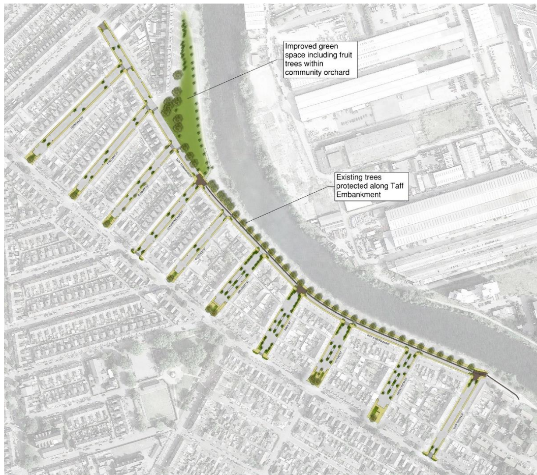
Figure 2 – Project extent showing new and improved green space

Innovative SuDS technology, in the form of 108 raingardens containing native trees and plants, targets improved water quality achieving both physical and biological treatment of surface water runoff before being discharged into the nearby River Taff via a new pipe network. The CIRIA SuDS Manual was introduced part way through the design development. The site assessed as medium within the pollution hazard indices, with most of the site residential. The rain gardens and tree pits act as bioretention systems that can mitigate against this indices. Research is also underway to understand water quality benefits of the SuDS components, including research led by Dŵr Cymru Welsh Water into the effectiveness of the rain gardens and tree pits in removing microplastics.