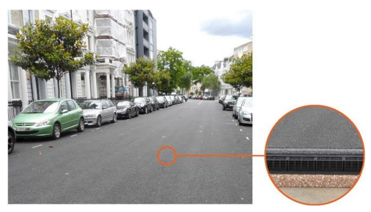
Fig 3; Arundel Gardens, Kensington showing the porous asphalt across the road

At Arundel Gardens, Kensington , porous asphalt has been laid across the whole width of the road with enhanced attenuation within a shallow layer of geocellular boxes. This attenuation is separated in cascades with flow controls between them to maximise use of the attenuation and to minimise pass forward flows.