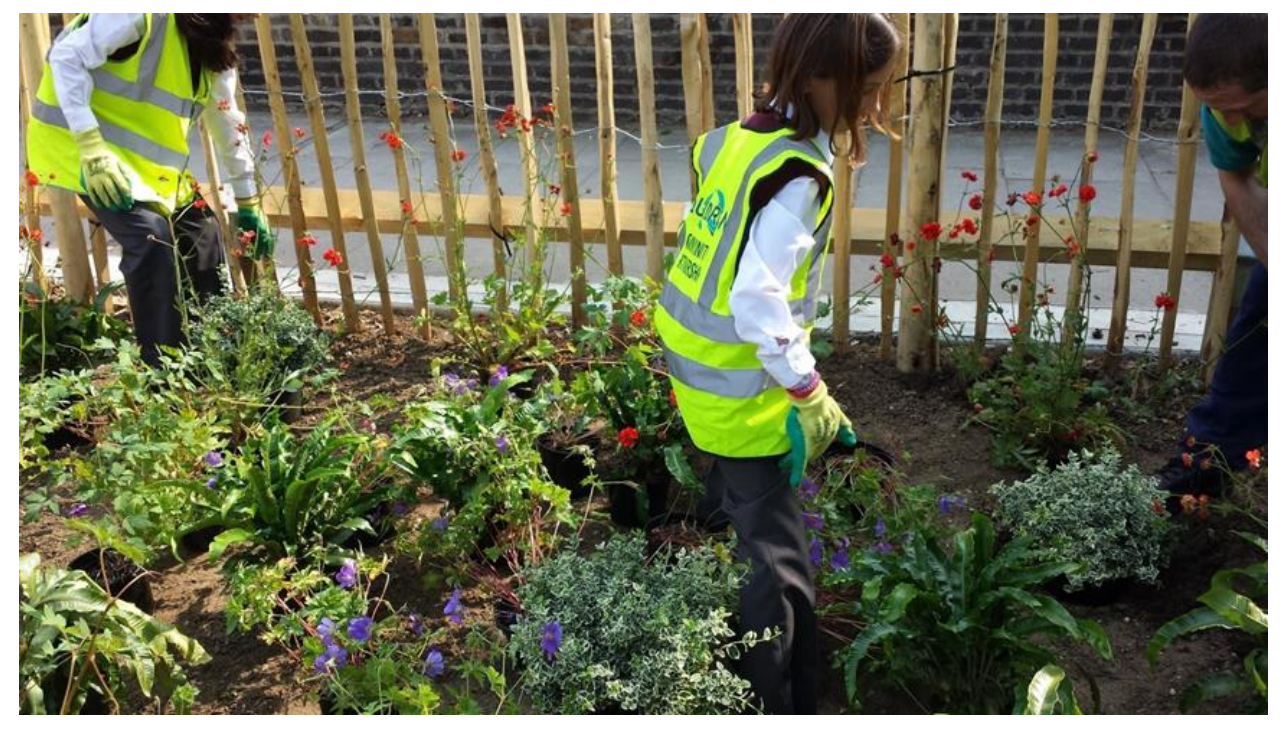
Fig 5; Local school engaged in planting at Melina Road, Shepard's Bush