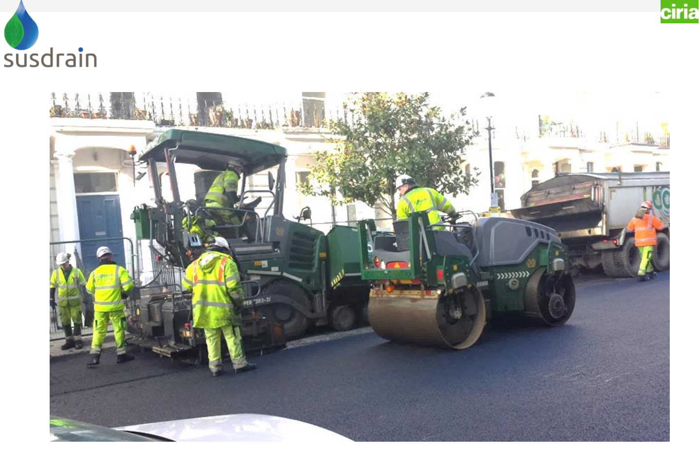
Fig 6: Resurfacing Arundel Gardens, Kensington with porous asphalt