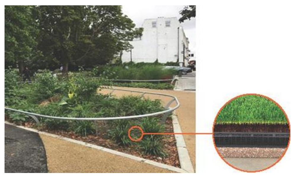
Fig 1: Example of rain garden at Melina Road, Shepard's Bush:

The Melina Road SuDS scheme has involved the installation of four new rain gardens in the existing pedestrian area at the southern end of the road. The rain gardens were constructed as typical bio-retention areas, with a topsoil surface that has allowed appropriate planting, and geocellular units beneath to provide the required attenuation.