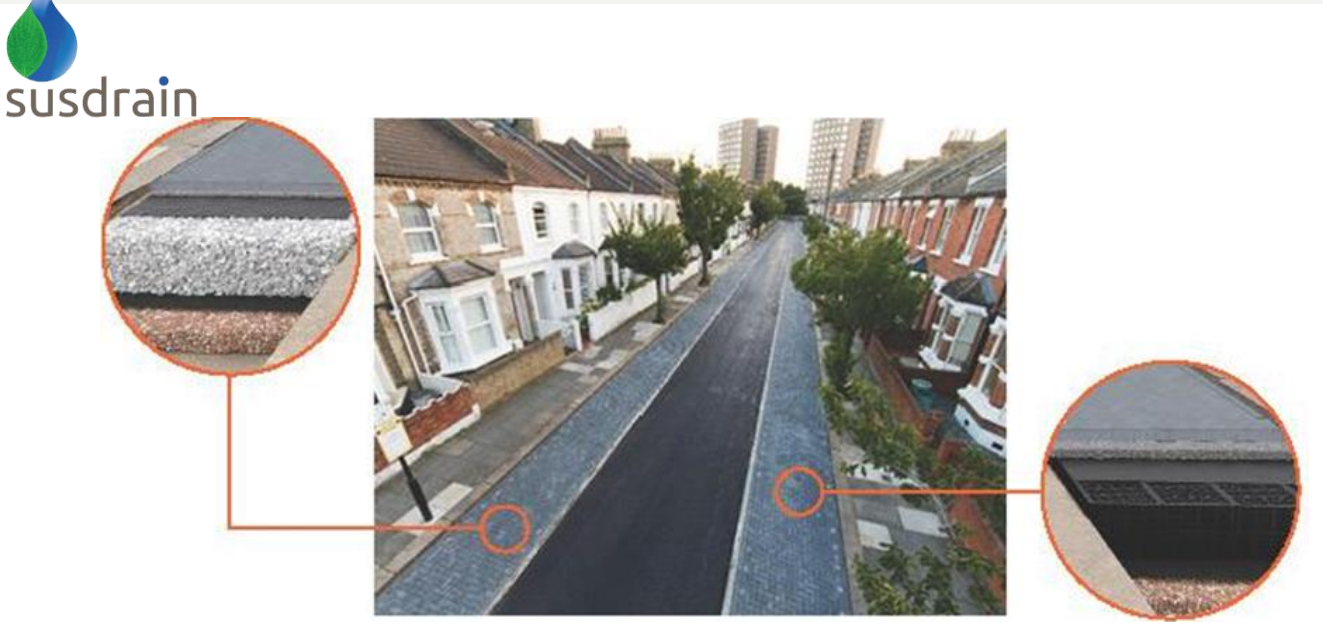
Fig 2: Mendora Road, Fulham – block paving on each side of the road

At Arundel Gardens, Kensington , porous asphalt has been laid across the whole width of the road with enhanced attenuation within a shallow layer of geocellular boxes. This attenuation is separated in cascades with flow controls between them to maximise use of the attenuation and to minimise pass forward flows.