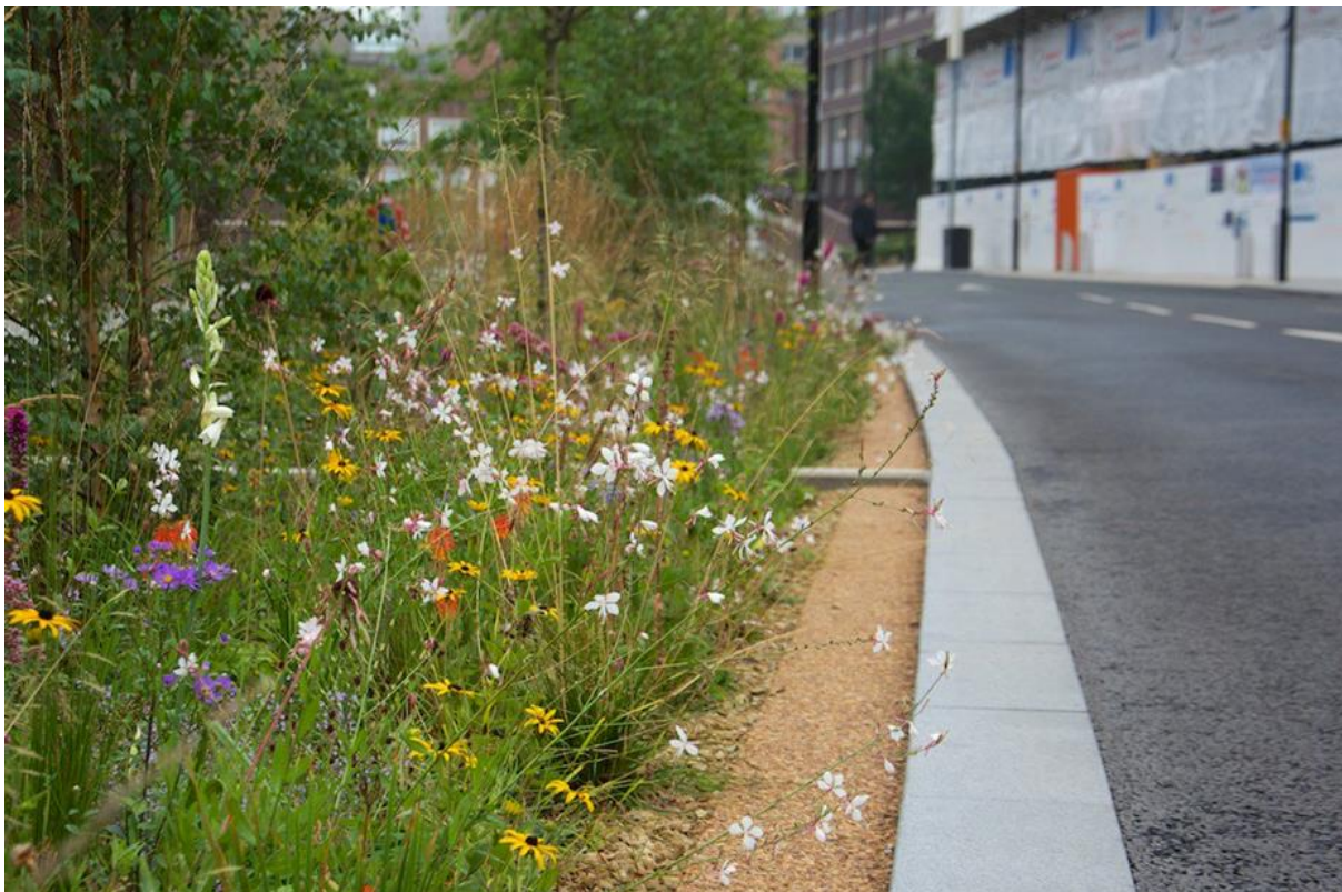
Fig.3 SuDs Cell edge treatment

SuDS principles are used to manage surface water with it being captured, treated at source, controlled and conveyed on or near the surface providing an opportunity for water to be part of the landscape. The scheme manages flows from the new paved pedestrian/cycle surfaces as well as half of the highway (service depths made it difficult to re-profile whole highway). Runoff is collected via simple over edge flush kerbs into a swale running the length of the scheme.