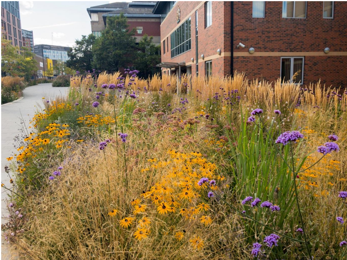
Fig.6 Seasonal interest is maintained throughout the year – Autumn in the 2 nd year of establishment SCC

The development of this scheme has led to an on balance reduction in maintenance costs associated with removing bituminous surfacing, gulleys and traffic management equipment and replacing with landscape. However specifically with the SuDS, the close working with the Highways maintenance client and contractor concluded that the drainage function of the SuDS landscape combined with the unimpeded run-off of flow into the landscaped SuDS areas was of very low risk and maintenance input. The low maintenance high impact planting using one cut a year was also intended to keep costs down. 3 years of establishment maintenance through a specialist local contractor is ensuring the scheme maintains a high standard.