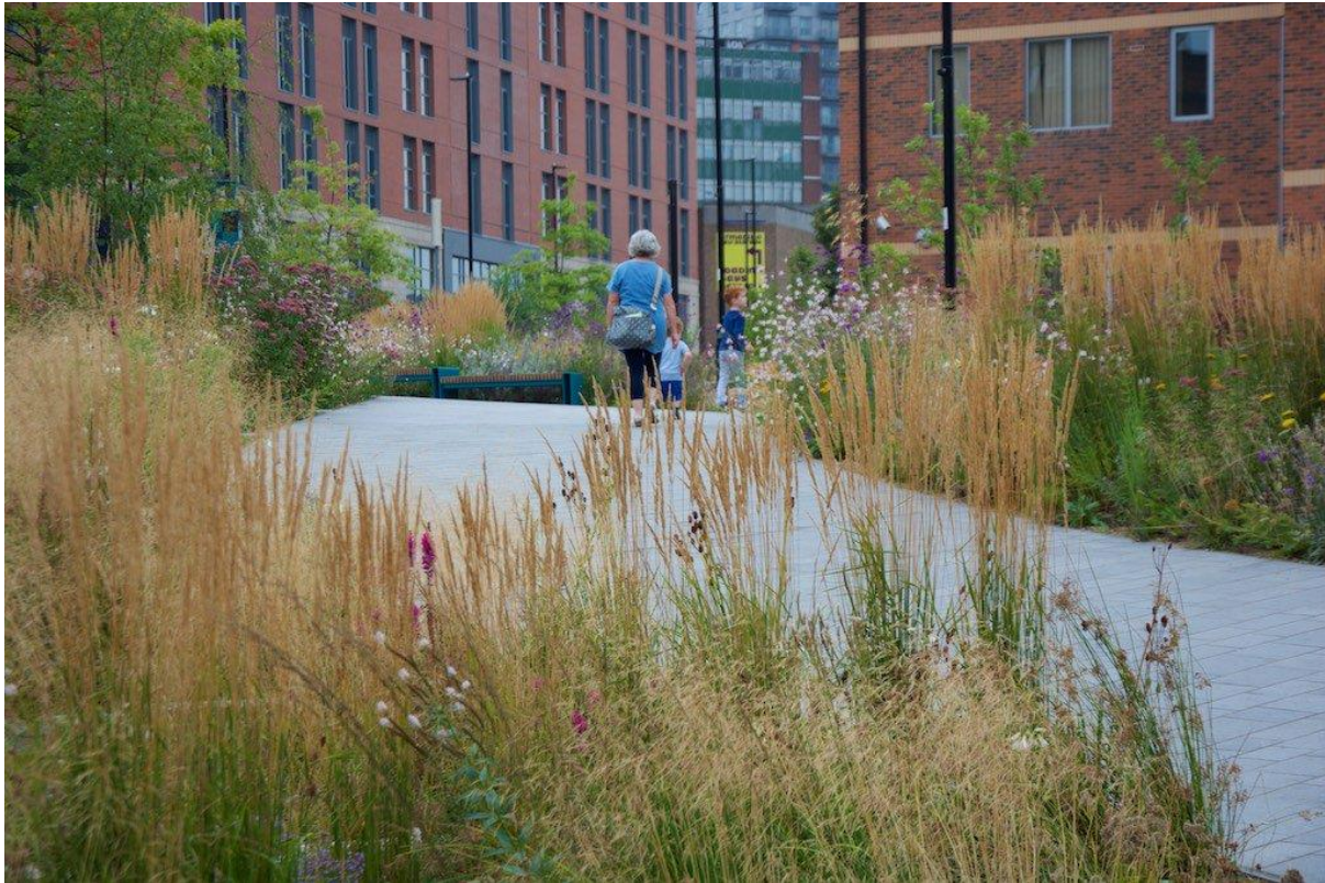
Fig.7 The established areas attracting people to interact with the new landscapes