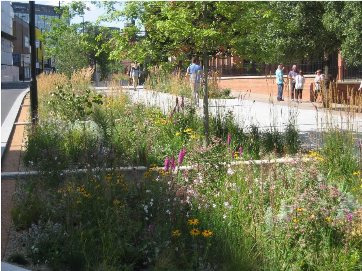
Fig.1 SuDS Swales in mid summer in the 1 st year of establishment