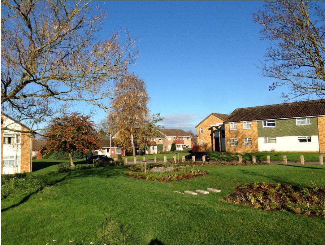
fig 4: Somme Road Detention Basin