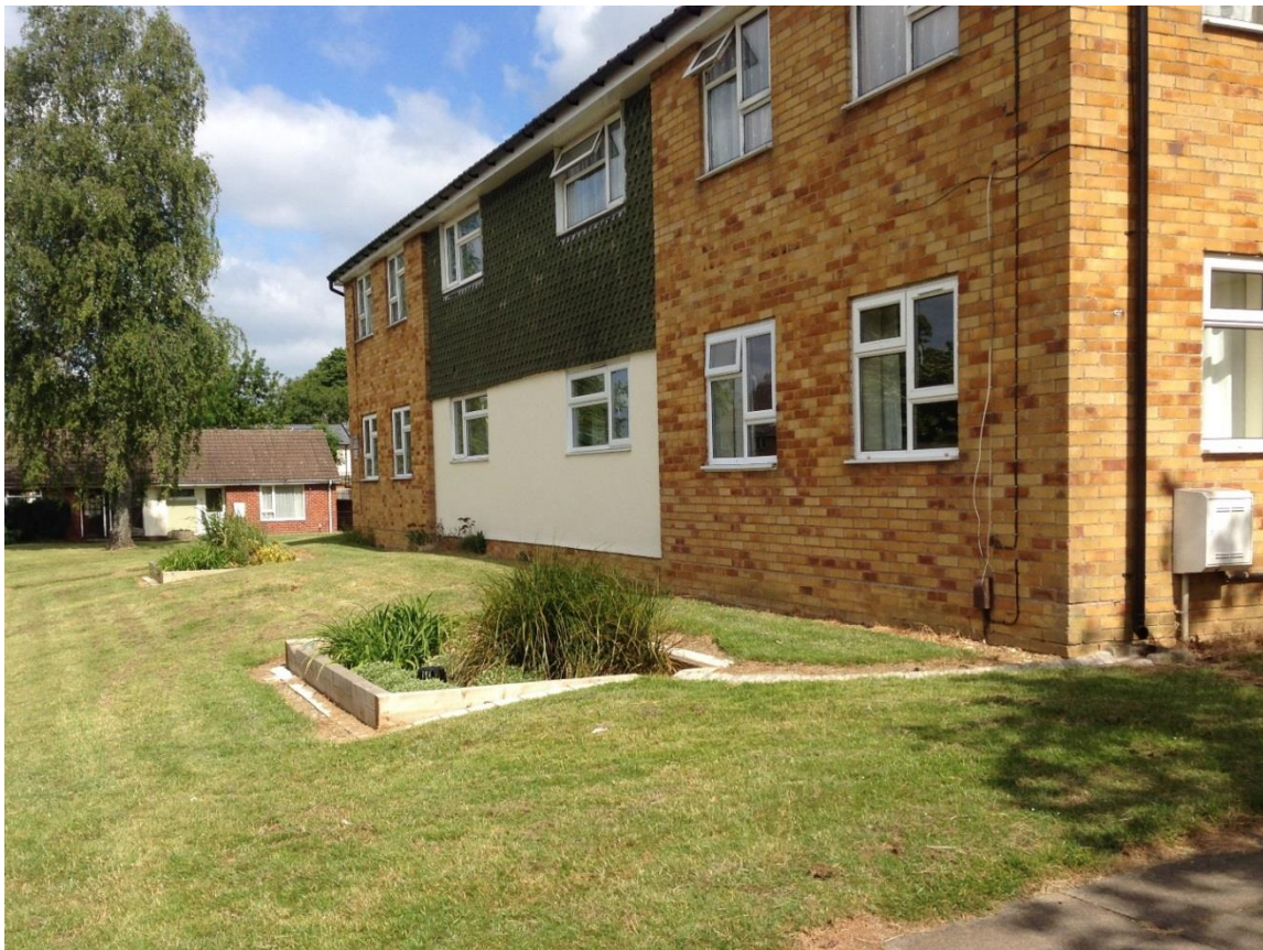
Fig 2: Complete rain gardens within open space

An overflow constructed of a 'top hat' outlet (used for flat roof drainage) was included to deal with exceedance events, should water levels at the surface of the planter reach more than the 150mm depth. A further exceedance route was created by cutting a small channel from the edge of the timbers to allow overflow down to the road.