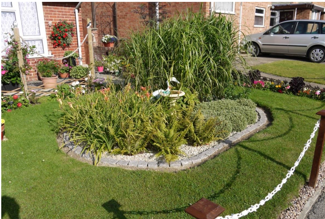
Fig 7: A completed rain garden with homeowner personalisation

Improved bio-diversity: previously the gardens and public areas were a ‘green desert’ of short mown amenity grass, offering little to no species diversity. Following completion of the scheme considerable new planted areas have been created containing both native and ornamental species, and a range of habitats from damp grassland in the summer to. Areas of wildflower meadow were also incorporated. Mallard ducks have even been seen in the basins following high flood event.