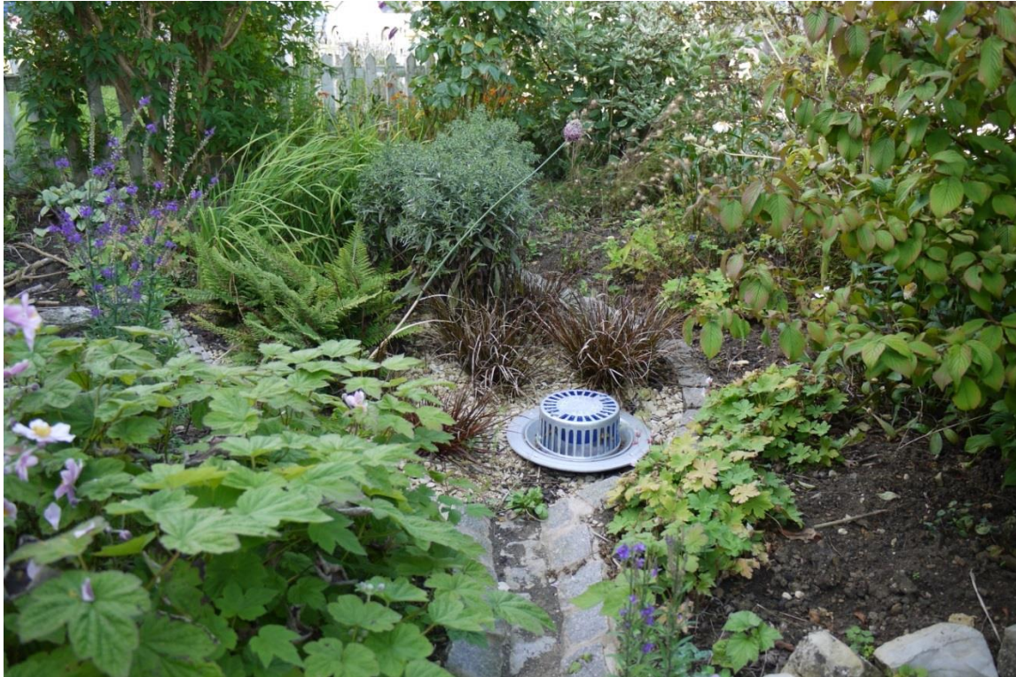
Fig 3: Completed rain garden within a private garden