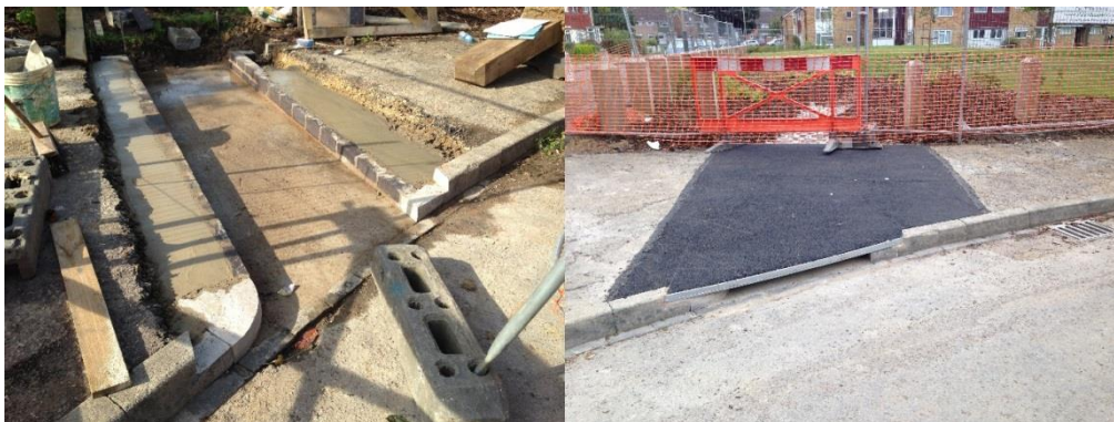
Fig 5: Inlet construction and complete with steel tray.

Open channels across the public footpaths were seen as a trip hazard, and therefore a creative solution was required to convey run-off from the road across the footpath into the basins, with no disruption to surfacing. A steel ‘tray’ was proposed which provided a wide shallow inlet beneath.