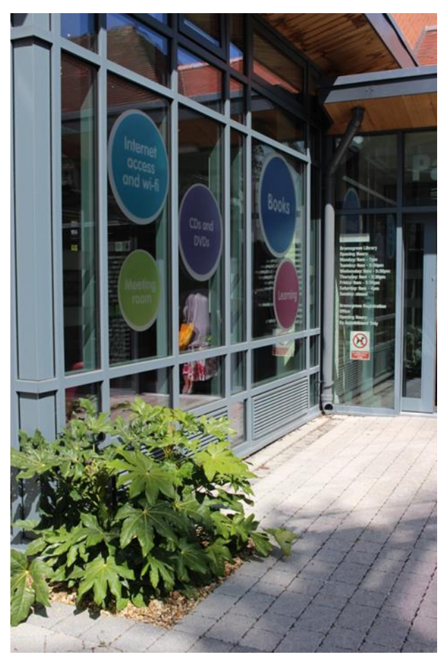
Fig 7: Library entrance