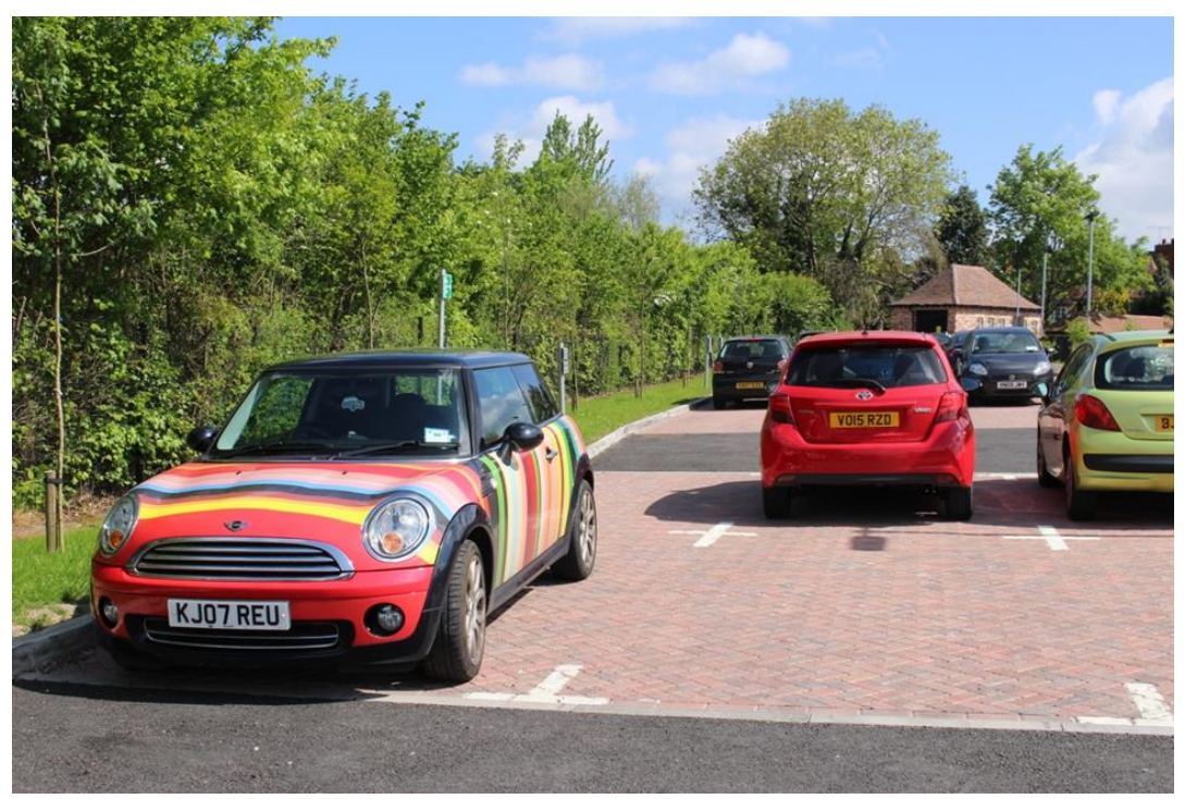
Fig4 : Permeable block paving to car park