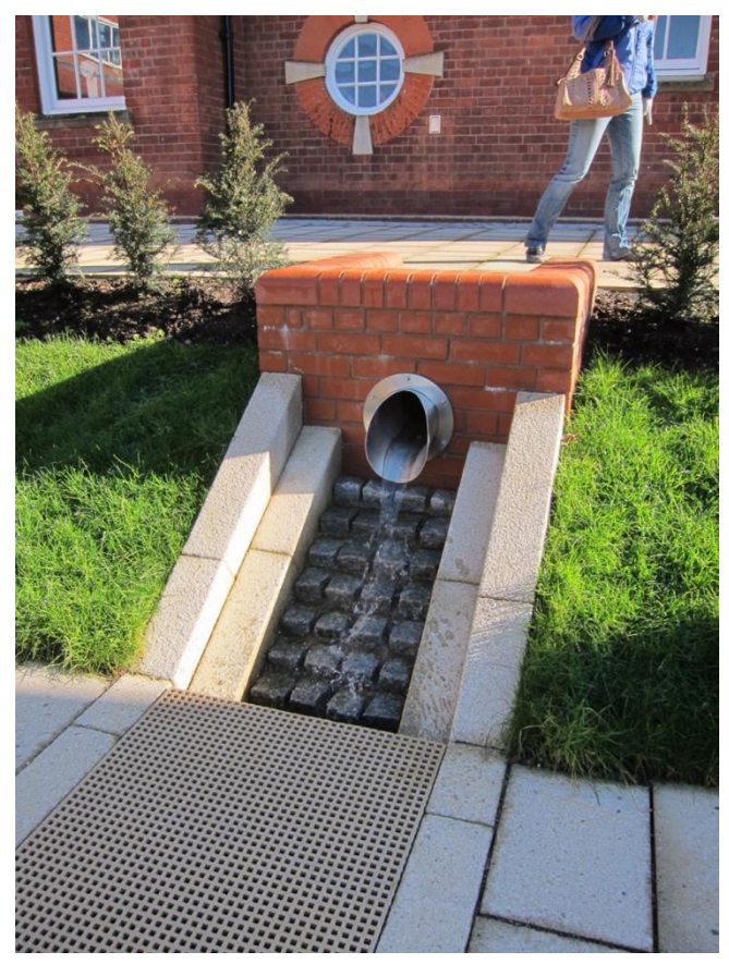
Fig 5: Solar powered water spout