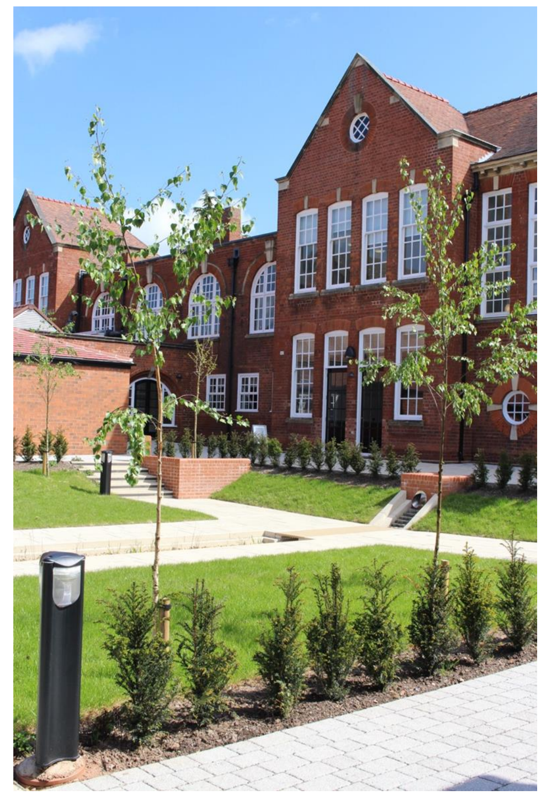
Fig 1: School building and SuDS court