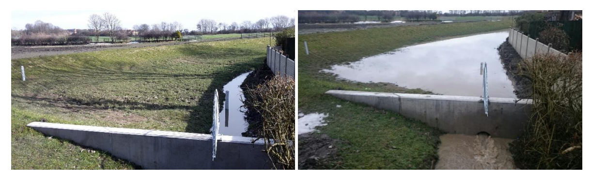
Figs 4 and 5 Killingworth Moor

SuDS attenuation is provided on the Forest Hall Letch with two stage channels. The photo on the left shows Forest Hall Letch in normal dry weather conditions flowing in the narrow channel. The photo on the right shows the attenuation working to manage surface water runoff by filling the wider storage channel, by the controlling flow downstream with the orifice, and by maintaining top water level with the weir. This work was completed as part of Phase 2 work.