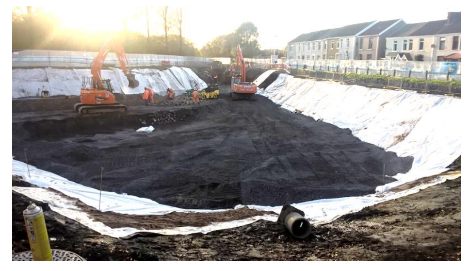
Fig 10 Cambrian North Basin excavations

The project brought together Arup landscape architects, geotechnical and civil engineers and environmental consultants who developed the design with Morgan Sindall, considering buildability from the outset. A 3D model was created to manage the reuse of the 3000m3 basin excavations.