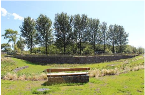
Fig 8: Bench and path linking footpaths