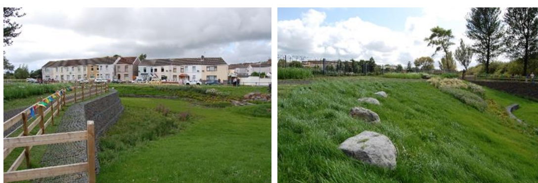
Fig 6 Gabion wall and fencing