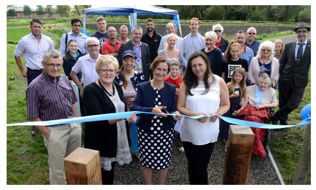
Fig 12 Community opening day (August 2017)