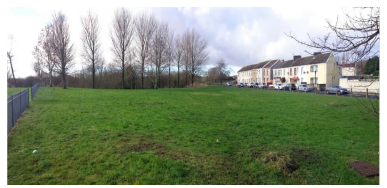
Fig 1 Cambrian North Basin before construction (February 2016)