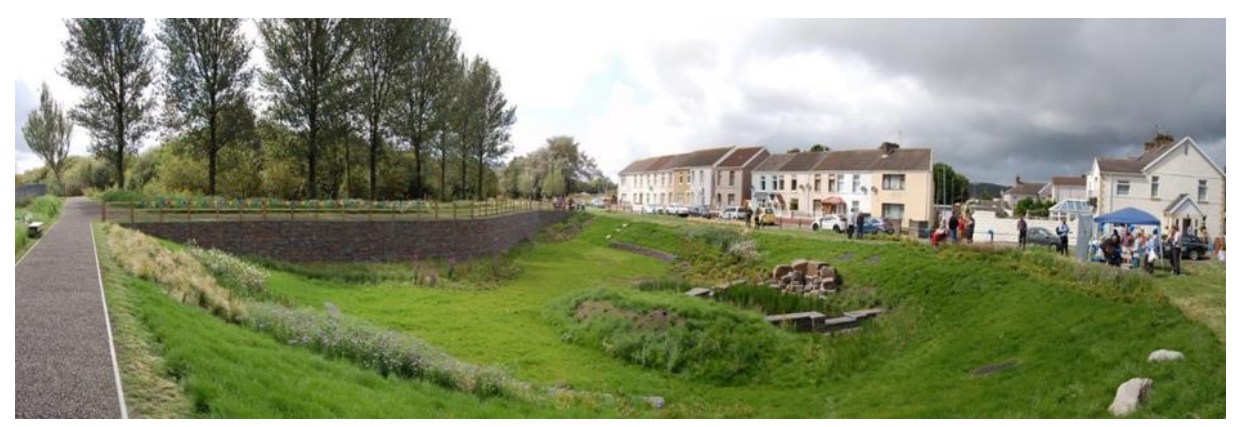
Fig 3 Cambrian North Basin after construction (August 2017)