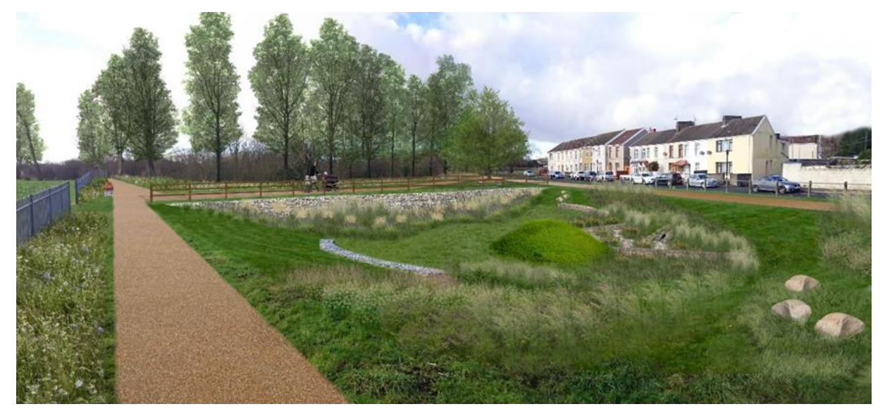
Fig 2 Cambrian North Basin artists impression