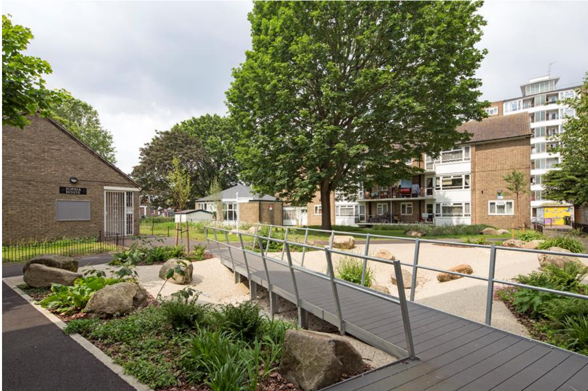
Fig 5 Queen Caroline Schotterasen gravel garden, adjacent to Adella House, and permeable paving and composite deck