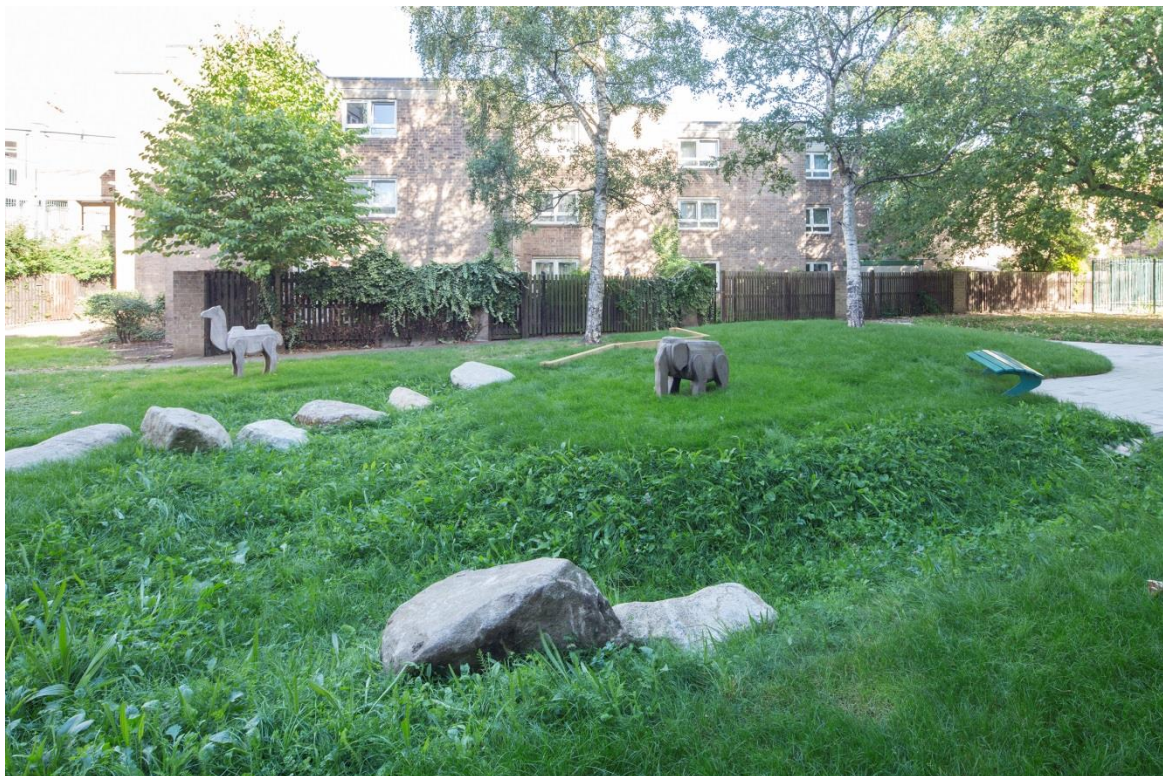
Fig 4 Orchard Square, Cheesemans Terrace, shallow meadow basins with informal play