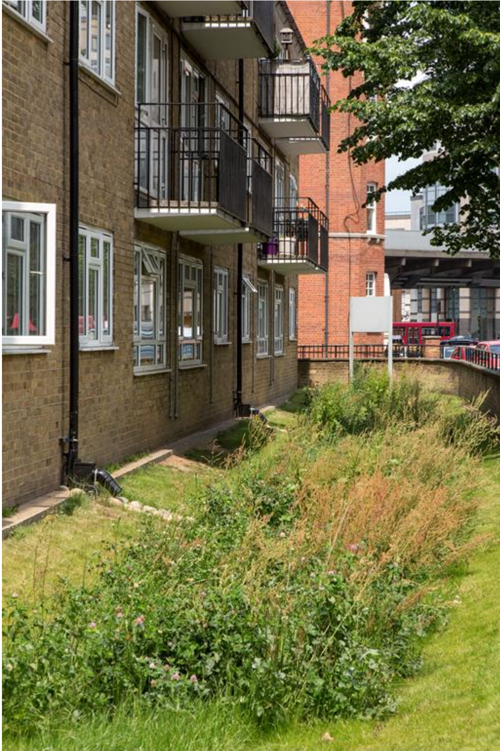
Fig 6 Queen Caroline Swale and pebble channel to down pipes