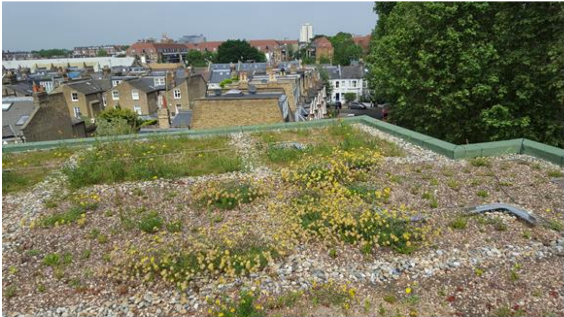
Fig 8 Richard Knight biodiverse extensive green roof