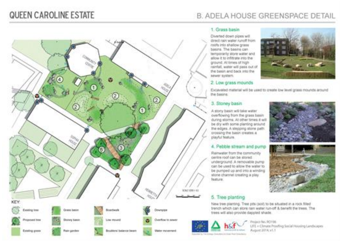
Fig 1 Queen Caroline drainage rationale for consultation