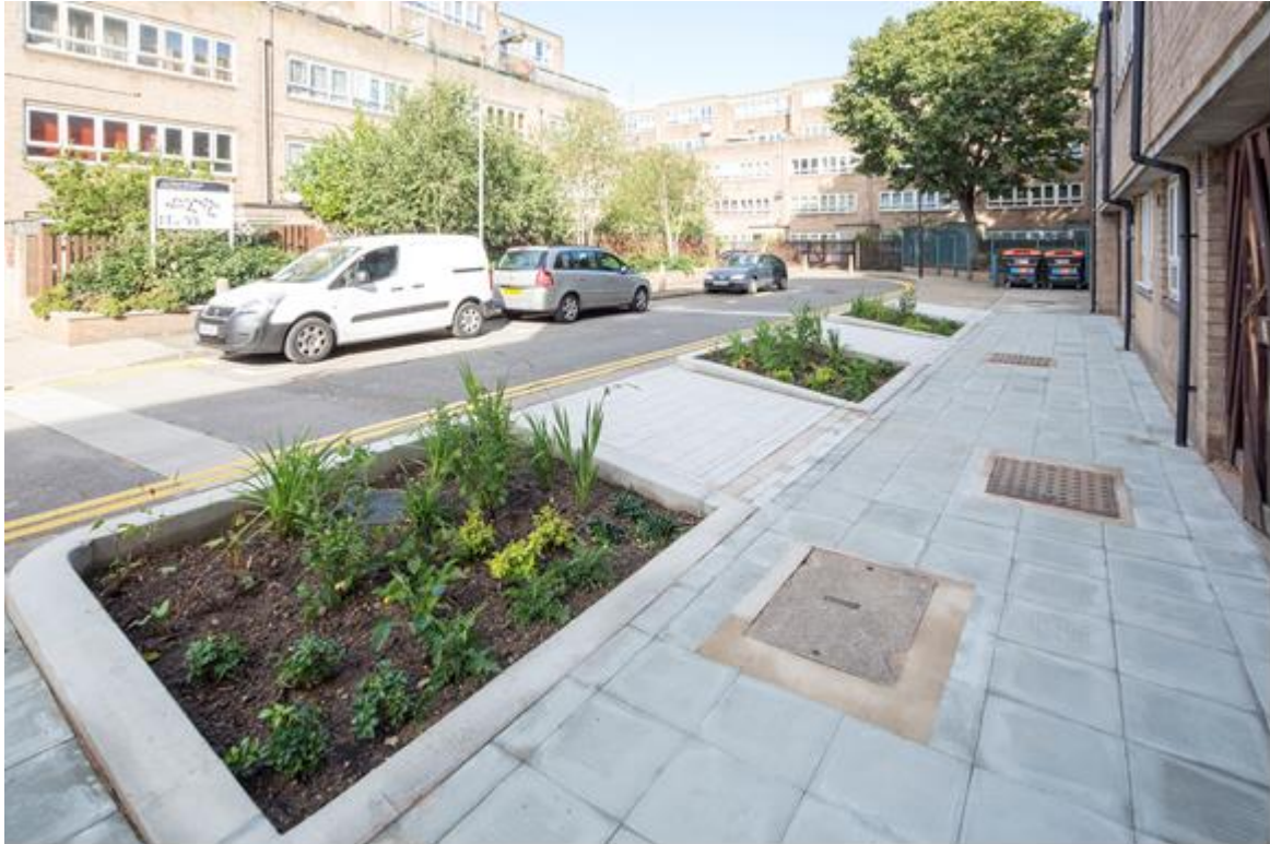
Fig 7 Sun Road, Cheesemans Terrace, rain gardens