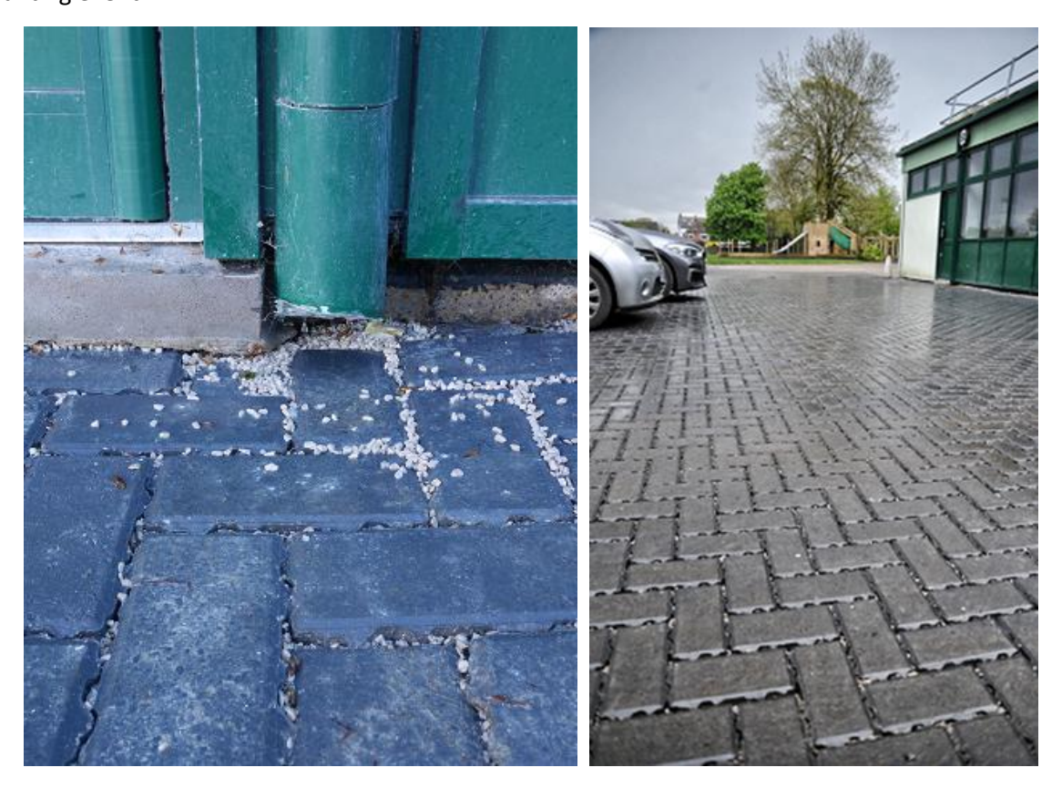
Fig 5: Permeable paving replaces an existing tarmac car park and offers a SuDS solution where space is at a premium