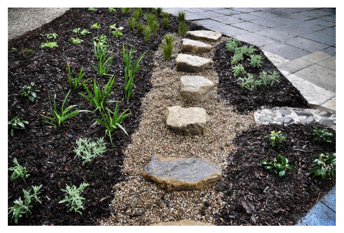
Fig 2: Stepping stones provide the opportunity for school children to interact with the raingardens