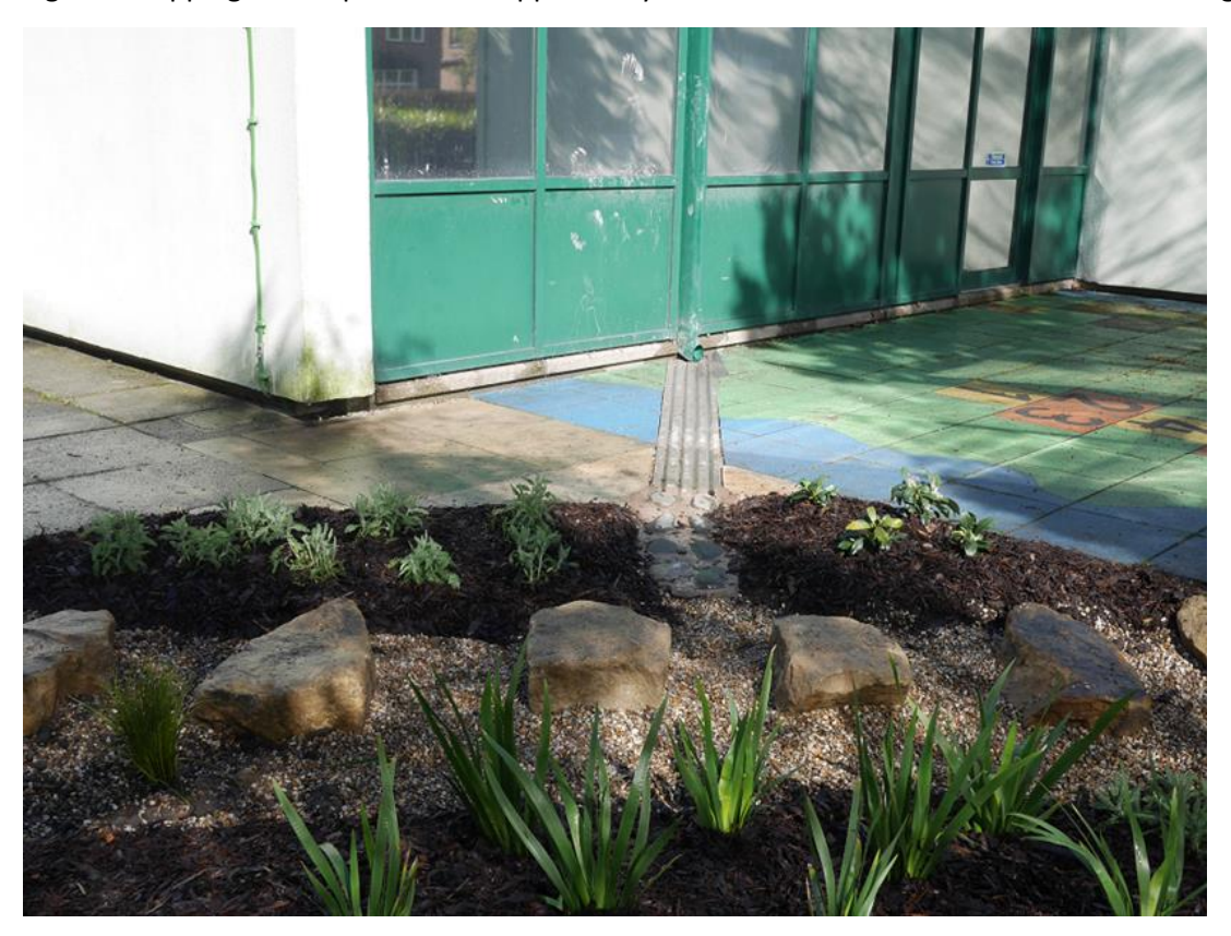
Fig 3: Fluted drain and river washed cobble cascade transfer surface water to the raingardens