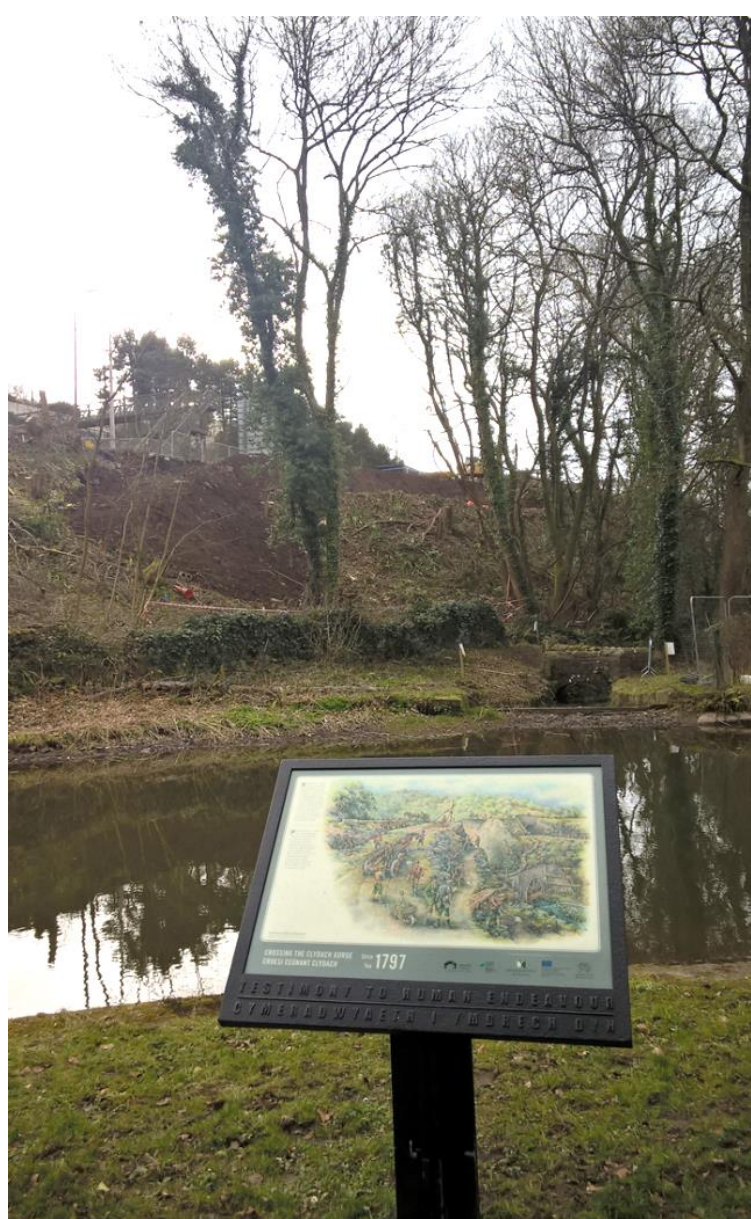
Fig 1: Outfall into brook (road construction visible at top of bank)