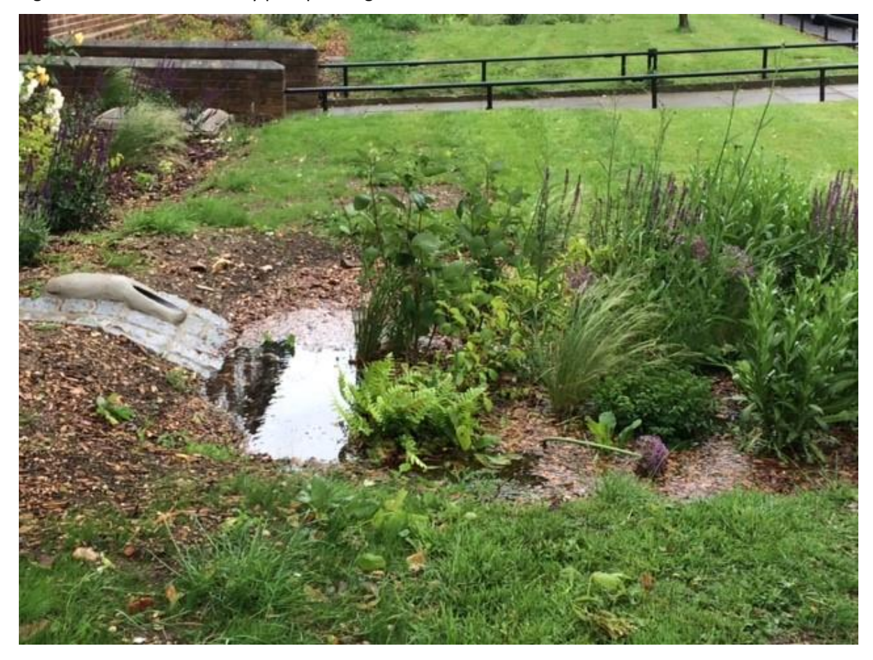
Fig 7: The rain gardens successfully storing water in a heavy rainfall event