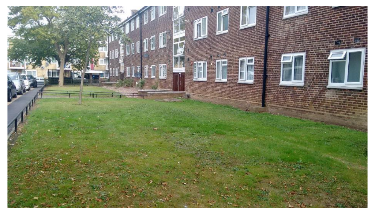
Fig 3: The gardens before planting, with downpipes direct to combined sewer