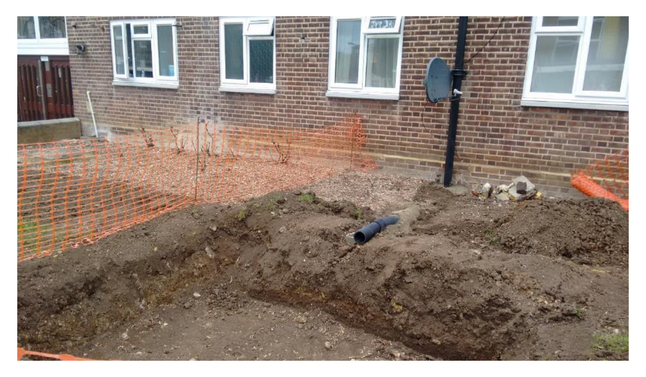
Fig 4: The gardens during construction, with overflow pipe