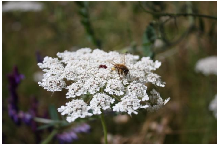
Figure 12 The site attracting a honeybee