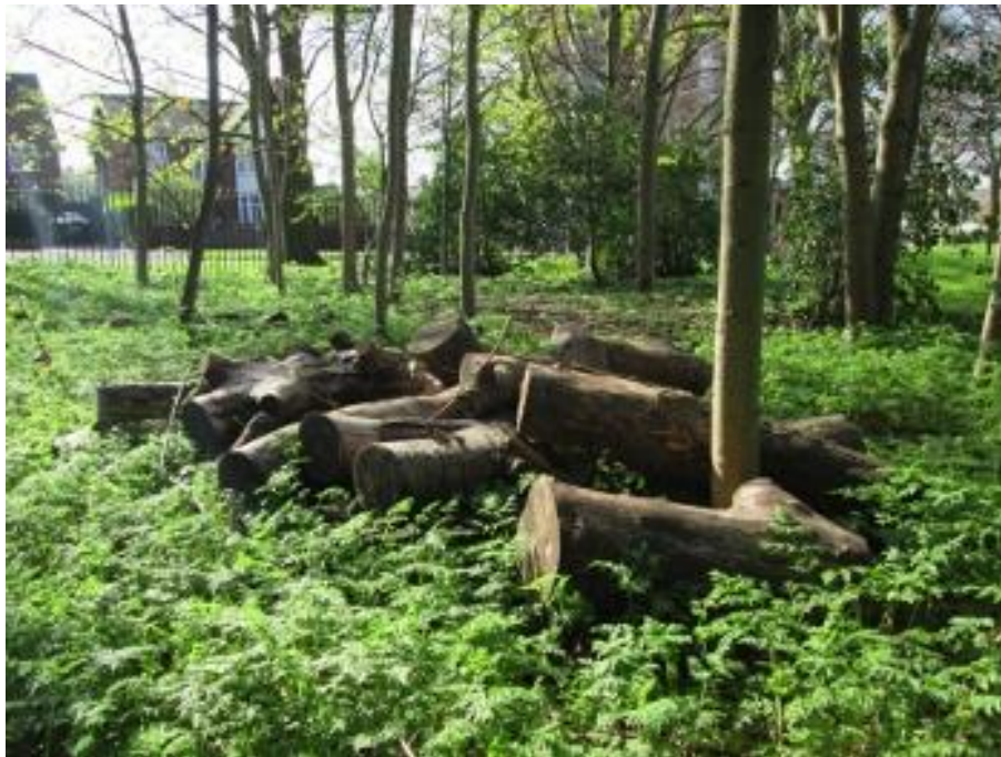
Figure 9 Habitat piles have been created in the existing woodland using timber felled on site