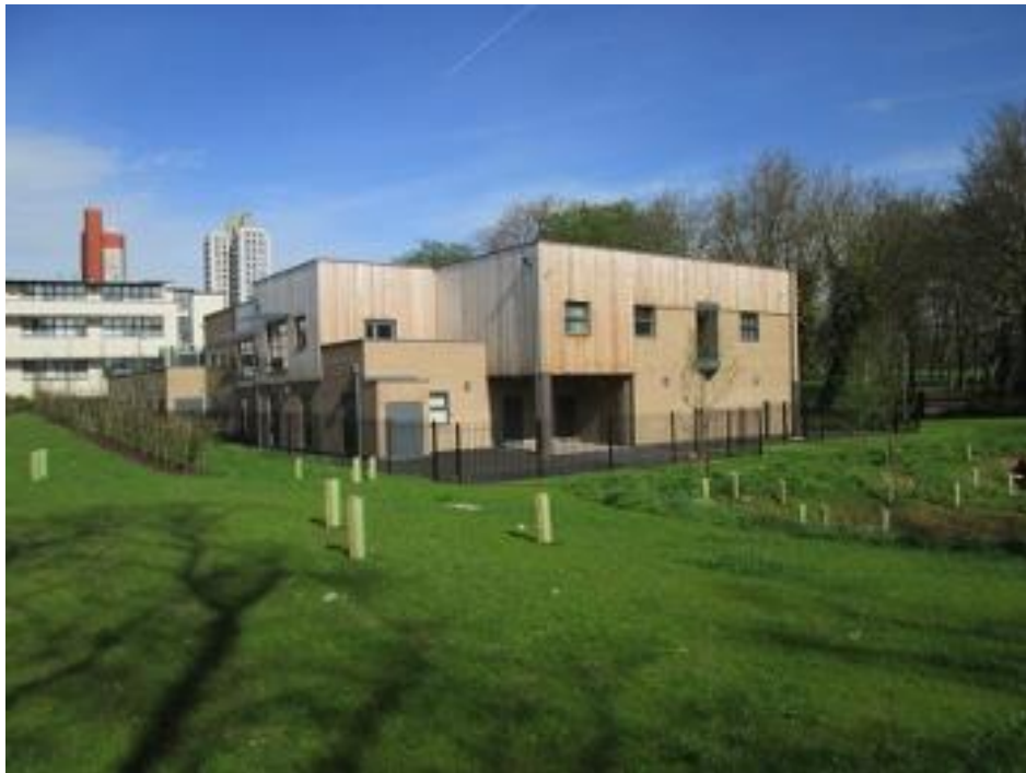
Figure 8 View of the health centre from the bund that partly screens it from the road