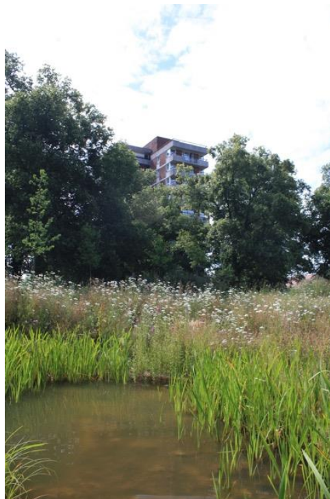
Figure 11 The site provides a natural haven in an urban setting