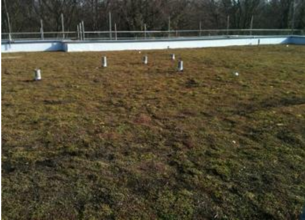
Figure 3 Biodiversity green roof. An all in one modular green roof system with an extensive sedum and lightweight soil-less wildflower mat laid over a 79-80mm substrate

The proposal to construct a two storey building in green space in the centre of Leicester demanded sensitive design. It became clear that dealing with the site's water runoff would require an innovative approach. Early investigations revealed that percolation of water into the ground was a suitable option and so a SuDS scheme was developed, incorporating a 'biodiversity' roof and an infiltration basin.