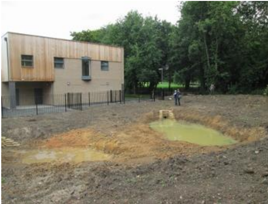
Figure 6 The infiltration basin during construction

number of treatment stages available for the car park runoff. Towards the end of the project the contractor made the gradients around the marshes too steep. It was necessary to meet on site and agree to form more gentle slopes. The site is subject to a landscape management plan (LMP). The contractors that installed the landscape are covering the 12 months maintenance of the site and DSA have been commissioned to produce an annual inspection and report.