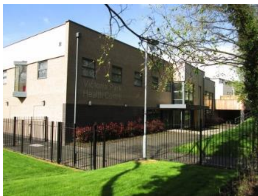
Figure 1 Victoria Park Health Centre main entrance

The Victoria Park Health Centre (VPHC) development is a two-storey health centre. The site is roughly 0.7 hectares in size and the site of a WW11 air raid shelter. Work began on the health centre in 2010 and was completed in winter 2013. The landscape design approach was intended to 'tie' the proposed scheme into its context and protect and enhance the landscape setting. The landscape design was developed in tandem with the architectural layout, to ensure that the proposal 'sits' comfortably within the existing landscape.