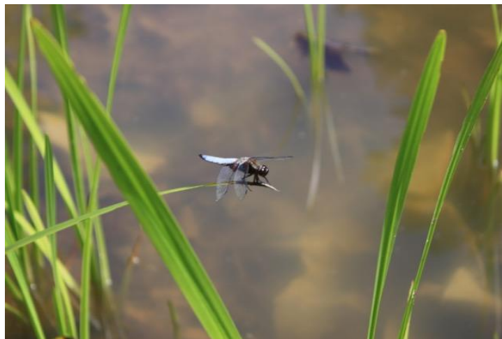
Figure 13 Broad Bodied Chasers are now also found on the site, attracted by Swales