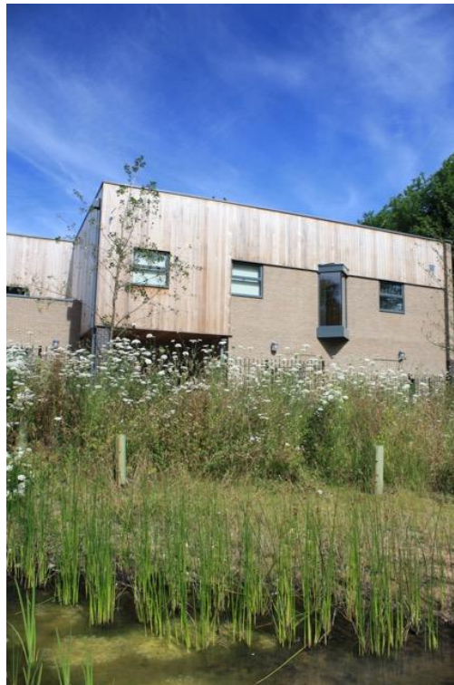
Figure 10 The Swales continuing to work well