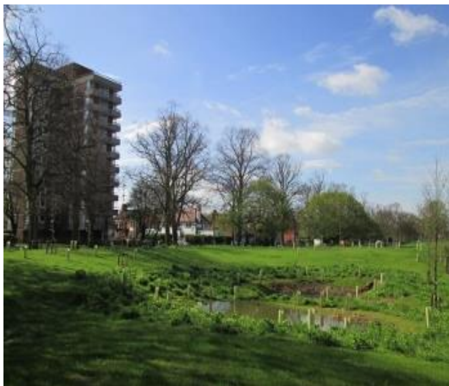
Figure 5 View towards Victoria Park Road and neighbouring residential area

It is anticipated that because the deeper sections of the basins hold more water, they will develop taller emergent and marginal planting, whilst the shallower sections and those that dry out more frequently will favour sedges and grasses.