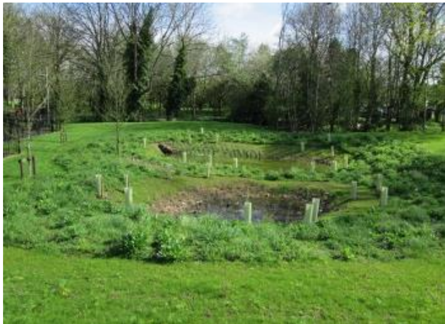
Figure 7 The infiltration basin with wildflower turf and grass seeding