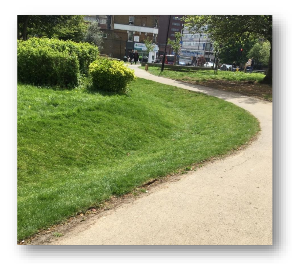
Fig. 7: Longest Swale within Park connecting rain gardens at both ends