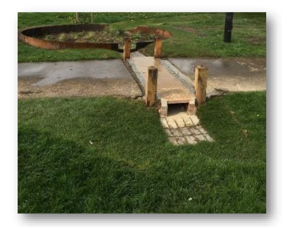
Fig. 4: A Bridge as playing feature, connecting two rain gardens via swale