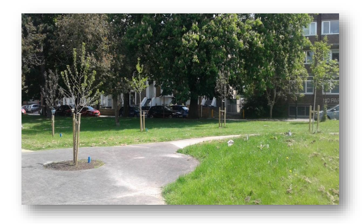
Fig. 8: Newly Planted Trees playing vital role in managing surface water