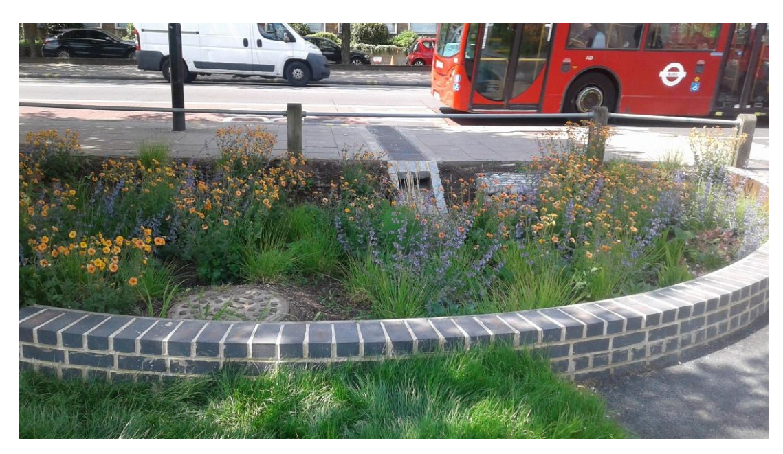
Fig. 2: Established Rain garden - Collecting surface water during storm event