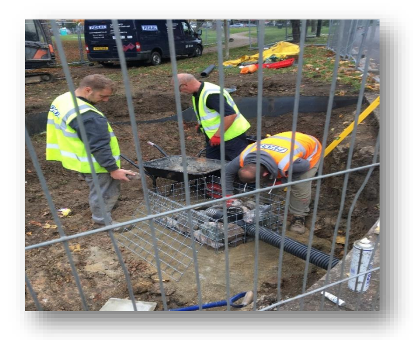
Fig. 5: During the construction of Rain garden at the end