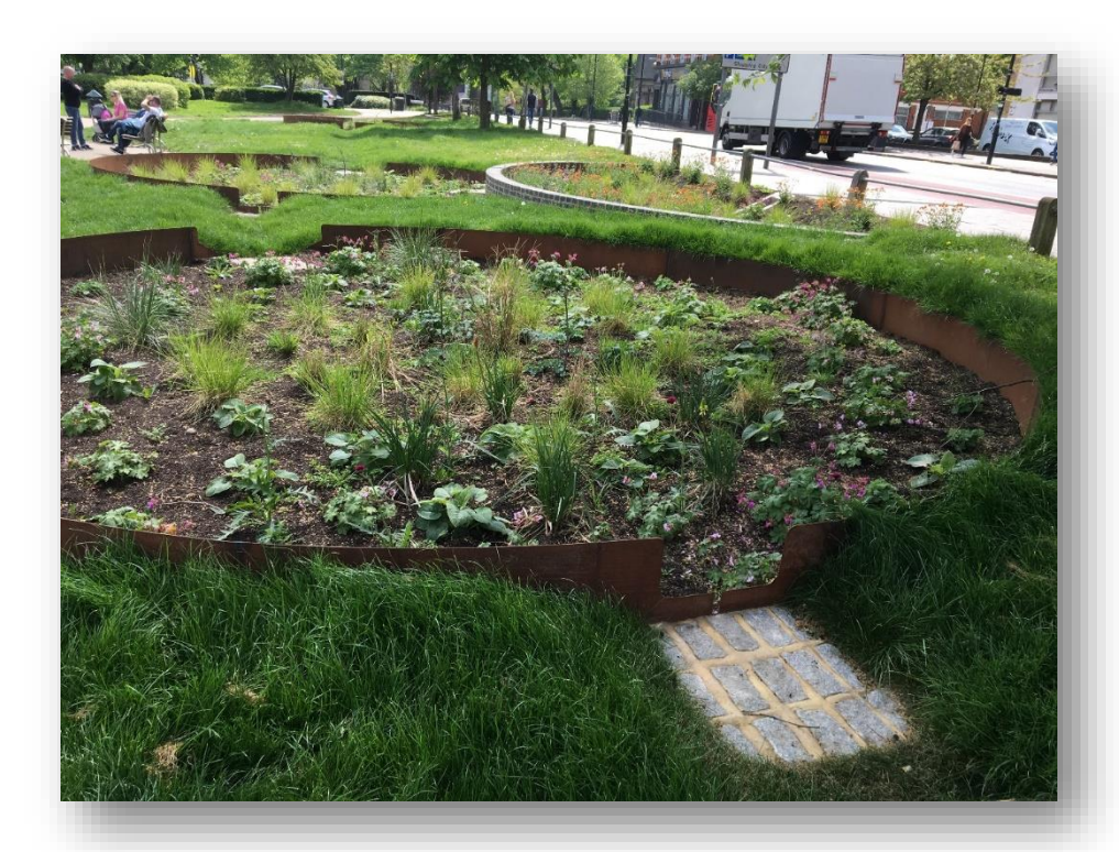
Fig. 3: Example of SuDS and Management Train used to link the areas and give character to the scheme. Also attracting people to interact with SuDS features.