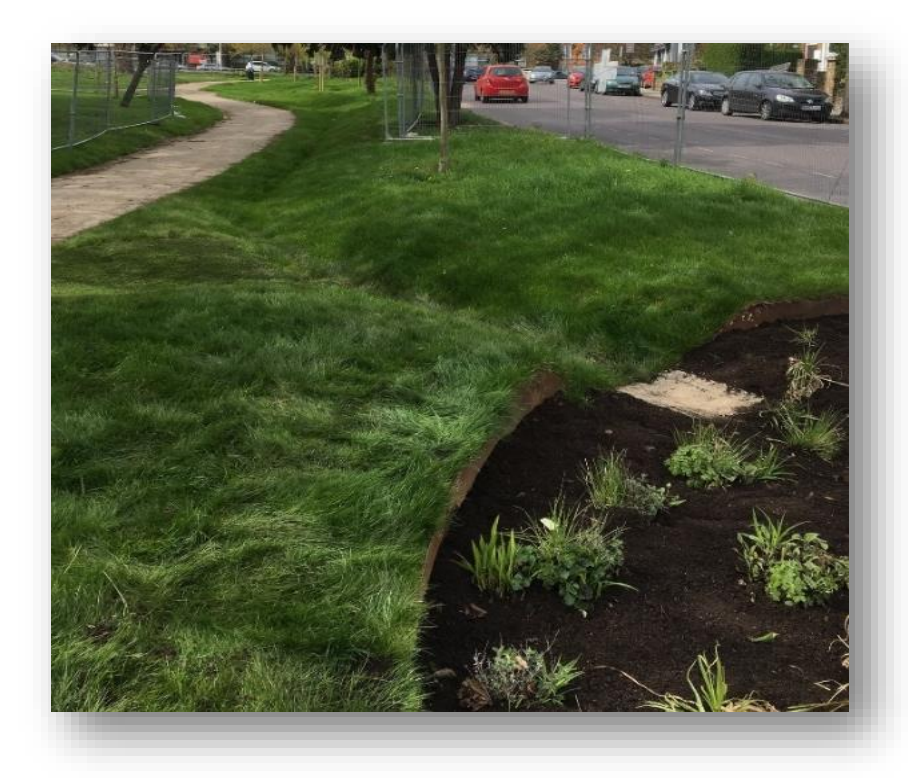
Fig. 6: After the Construction and linked with swale and other SuDS.