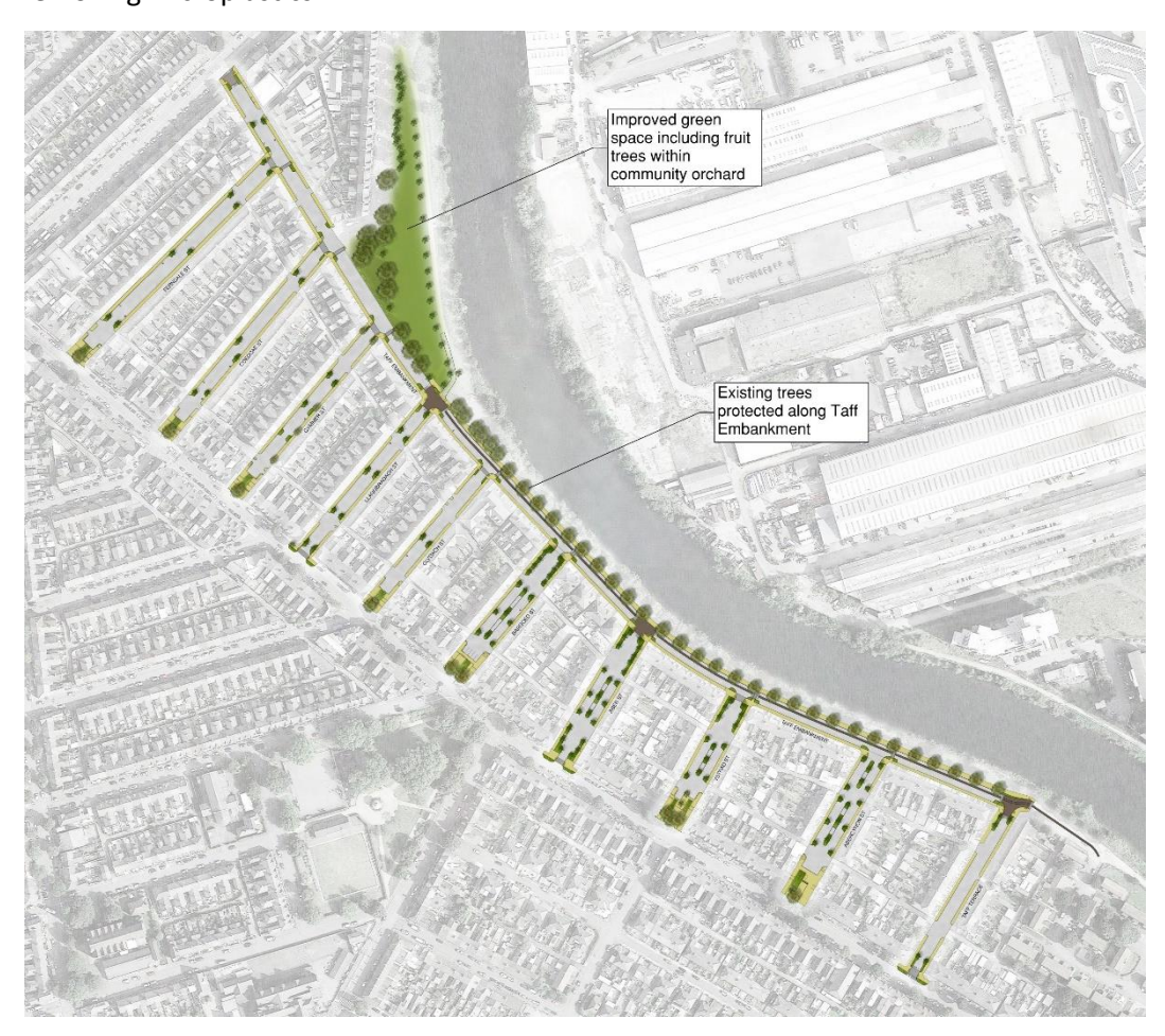
Figure 2 – Project extent showing new and improved green space

Innovative SuDS technology, in the form of 108 raingardens containing native trees and plants, targets improved water quality achieving both physical and biological treatment of surface water runoff before being discharged into the nearby River Taff via a new pipe network (this is continuously monitored). The CIRIA SuDS Manual was introduced part way through the design development. The site assessed as medium within the pollution hazard indices, with most of the site residential. The rain gardens and tree pits act as bioretention systems that can mitigate against this indices. Research is also underway to understand water quality benefits of the SuDS components, including research led by Dŵr Cymru Welsh Water into the effectiveness of the rain gardens and tree pits in removing microplastics.