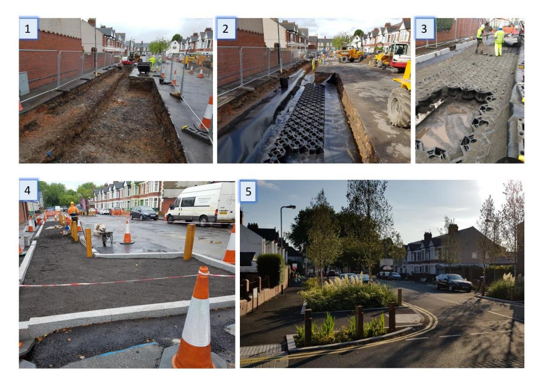
Figure 6 – Rain garden with below ground tree root cells during construction