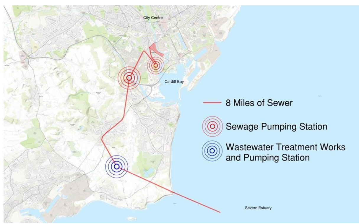
Figure 1 - Pre-construction unsustainable drainage

The project site covers 12 Victorian streets and 550 properties. Prior to the scheme, surface water entered the combined sewer network and was then pumped a total of 8 miles before being treated and discharged into the Severn Estuary. The concept for Greener Grangetown developed from the original aim of removing surface water that entered Dŵr Cymru Welsh Water's combined sewer network. This would reduce operational costs for the company and provide resilience against the impacts of climate change and urbanisation by providing extra capacity in the combined sewer system.