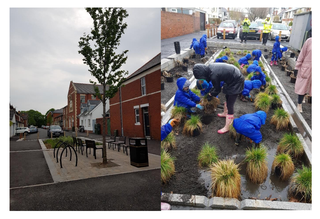
Figure 4 – Rain garden within regenerated public realm. Kerb and channel drainage keep water at the surface