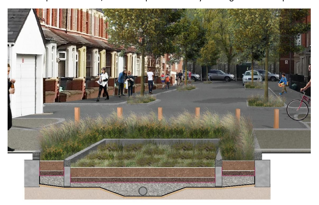
Figure 3 – Artistic impression of section through rain garden showing perforated pipe at the base Drainage is kept shallow wherever possible using recycled plastic composite kerb drainage and channel drainage units to convey flows from the busy Corporation Road into rain gardens located at existing dead ends of 7 of the streets. These create features within an improved public realm by adding green space to the area.

Grangetown is located on reclaimed former estuarine land. It was found through geotechnical investigations that infiltration into the ground was not feasible in Grangetown due to the presence of contaminated made ground and impermiable material. All of the SuDS features are therefor lined with an impermiable liner, which also protects nearby buildings from the impacvts of tree roots.