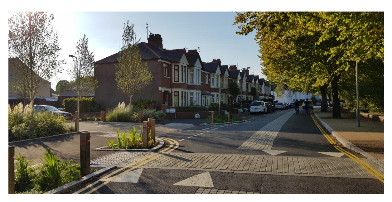
Figure 7 - Bicycle street, safer junction and widened pedestrian footpath along the Taff Trail

the stretch much safer for all. The riverside footpath has been widened and resurfaced. Locating rain gardens at junctions also improves visibility, making it safer for pedestrians, cyclists and vehicles.