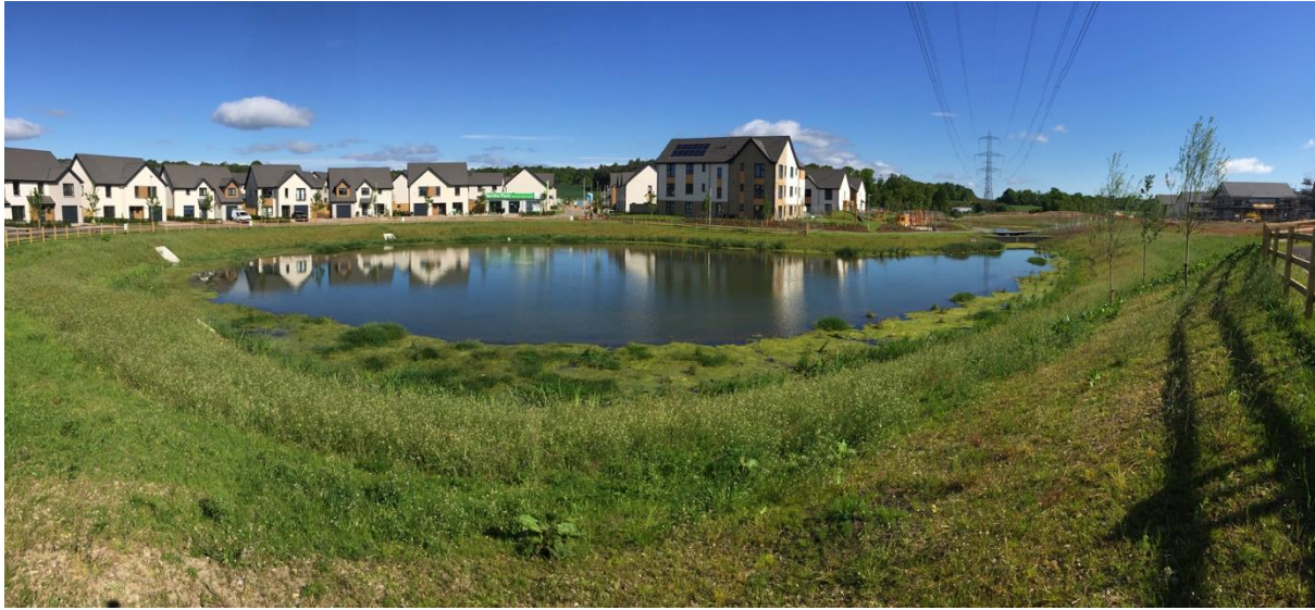
The main pond in first season