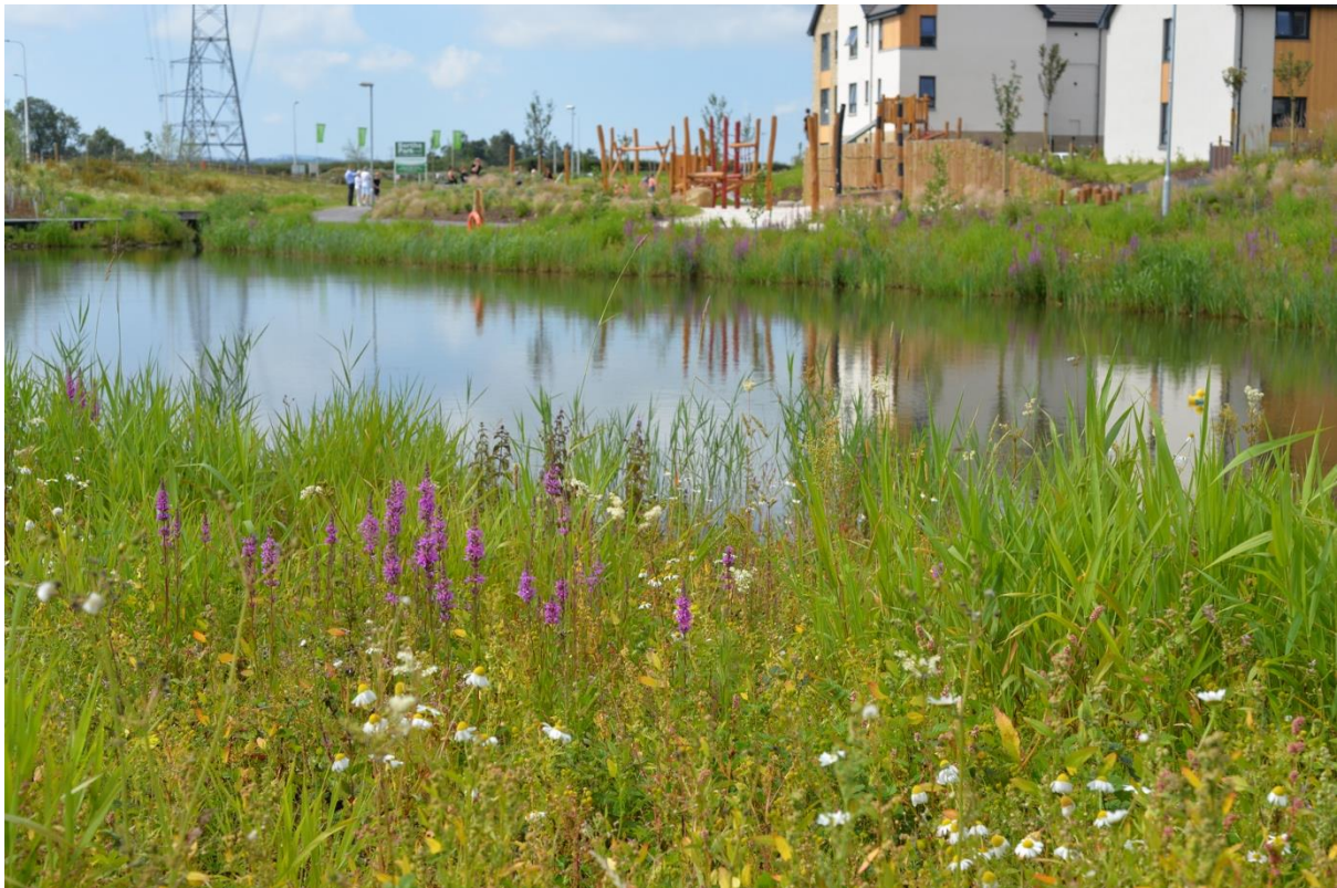
Biodiversity, play, cyclist route and SuDS enrich the housing