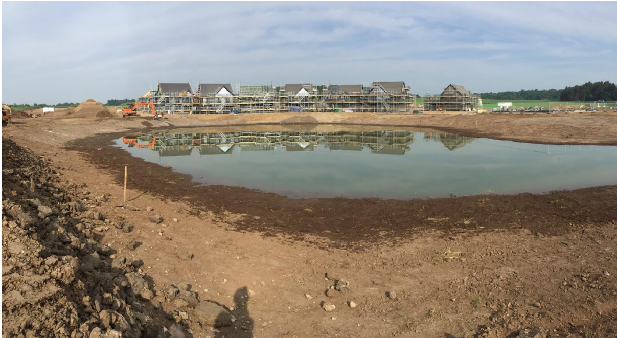
The main pond under construction