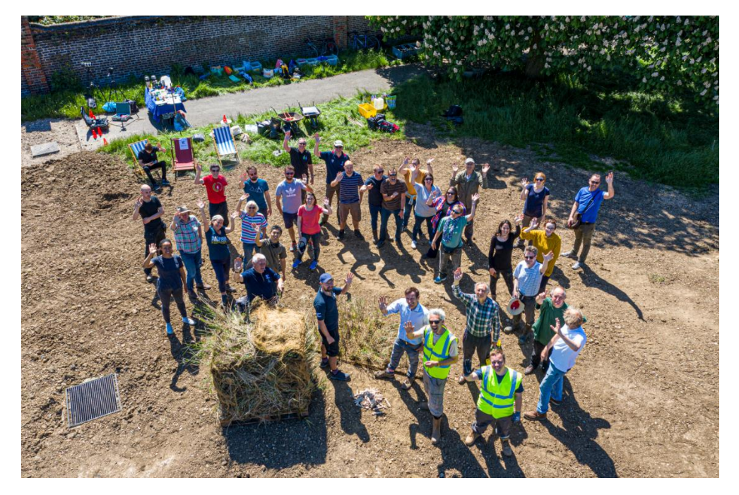
Volunteer planting event (late May 2019)