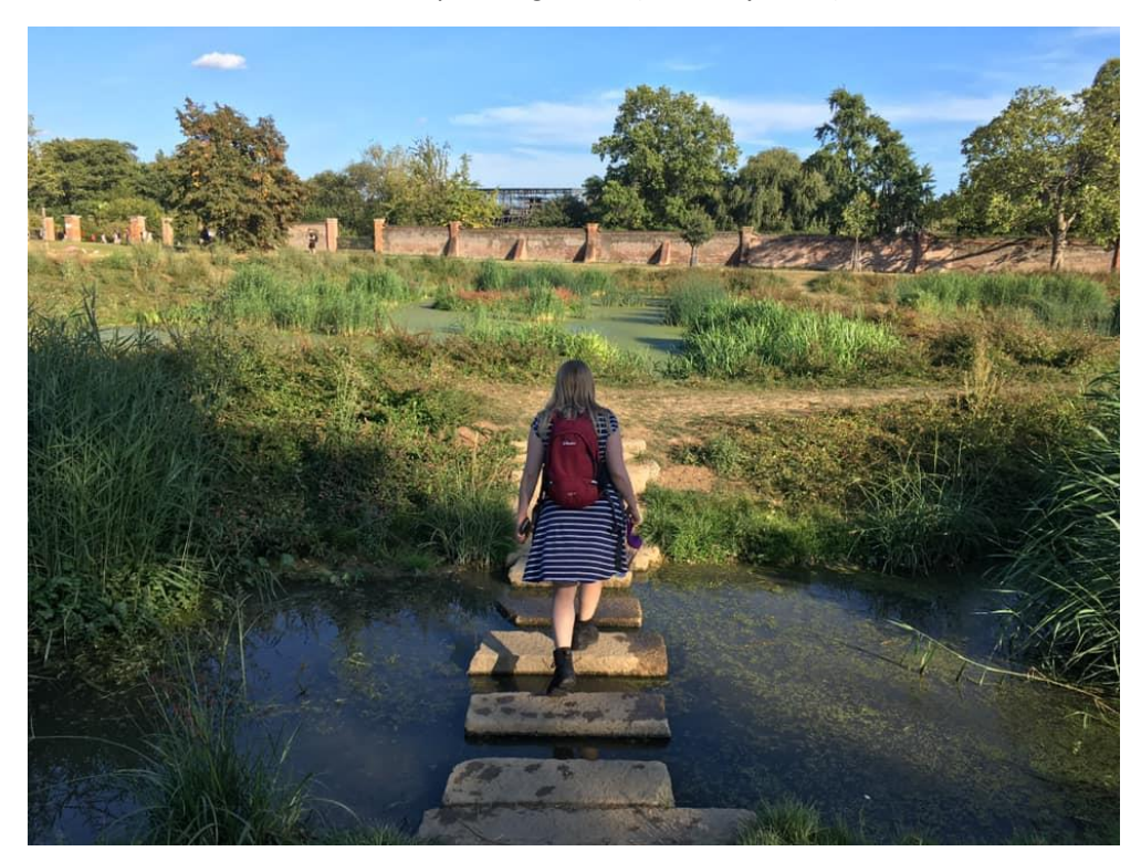
Stepping stones through wetland channel