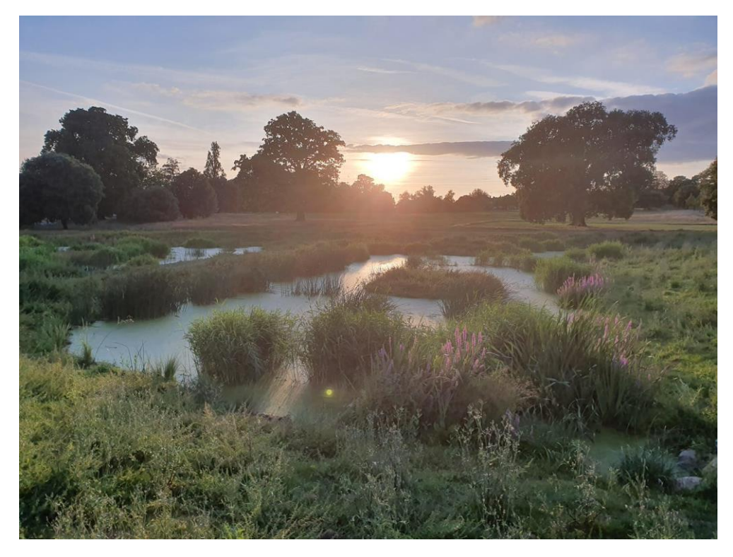
End of the first summer at the wetlands (September 2019)