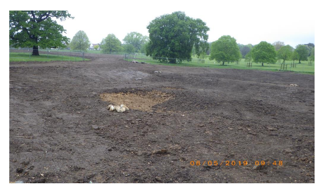
Final shaping of wetland cells with topsoil including formation of bund, deep pools and islands (early May 2019)