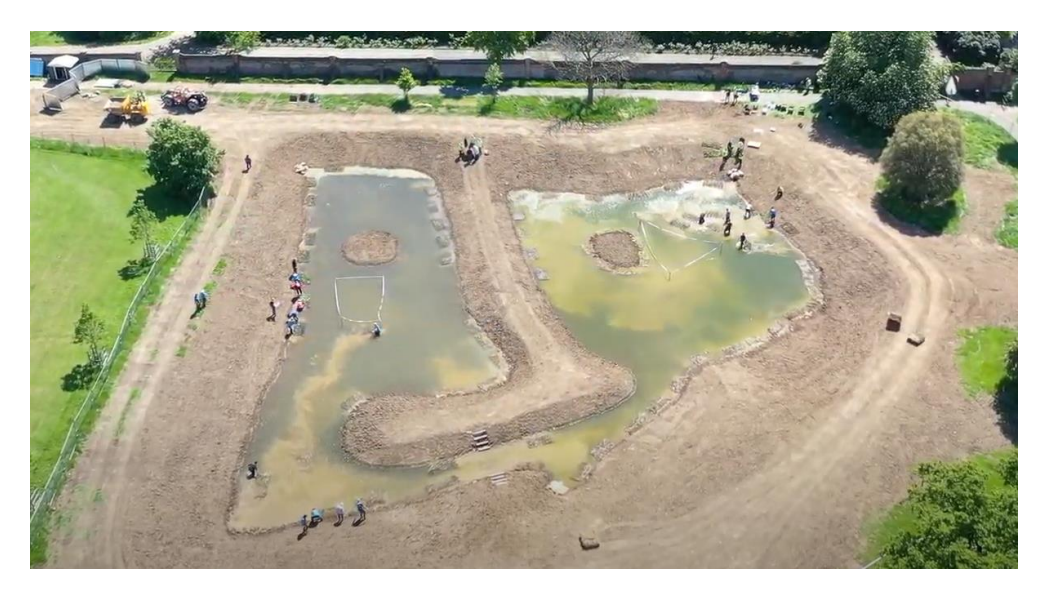
Volunteer planting event (late May 2019)