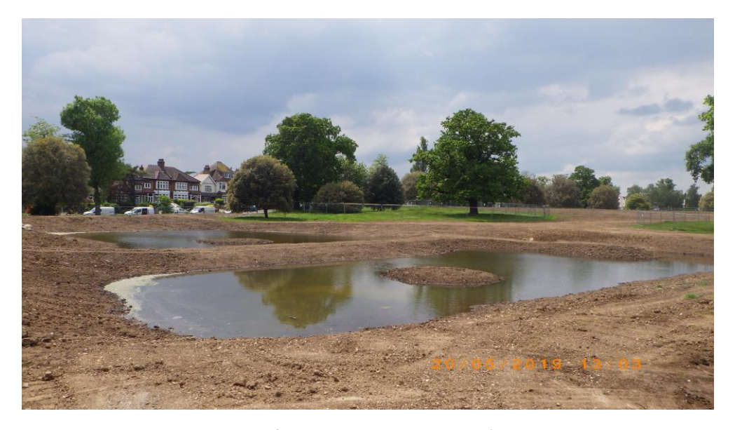
First connection of water into the wetlands (late May 2019