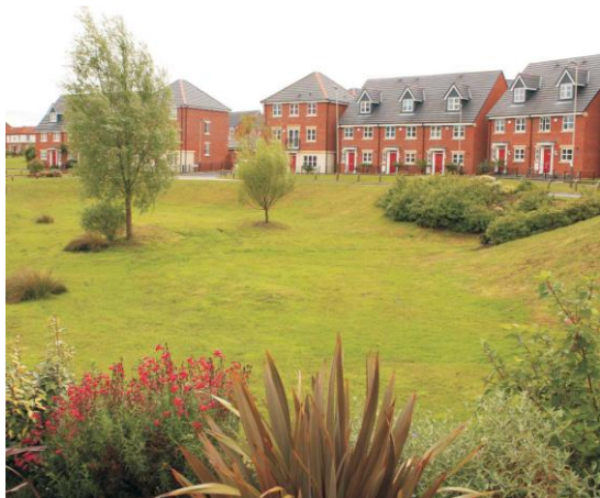
Figure 3 Detention basin forming part of the landscape in a low density housing estate

...retrofitting SuDS provides a significant opportunity to realise multiple benefits, presenting local authorities and other stakeholders with the potential to deliver “more for less”.