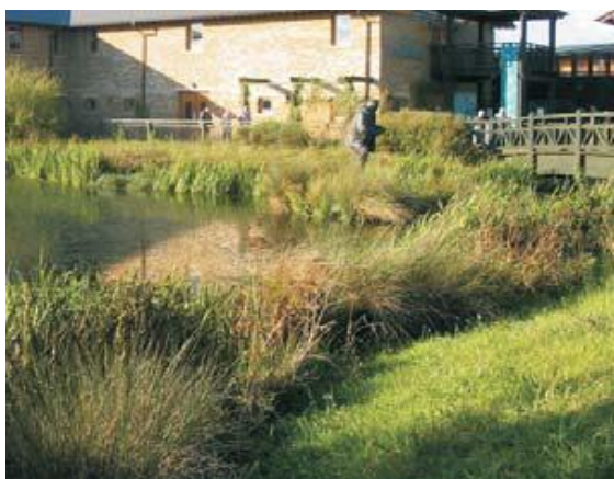
Figure 4 SuDS wetland forming part of a wildlife centre