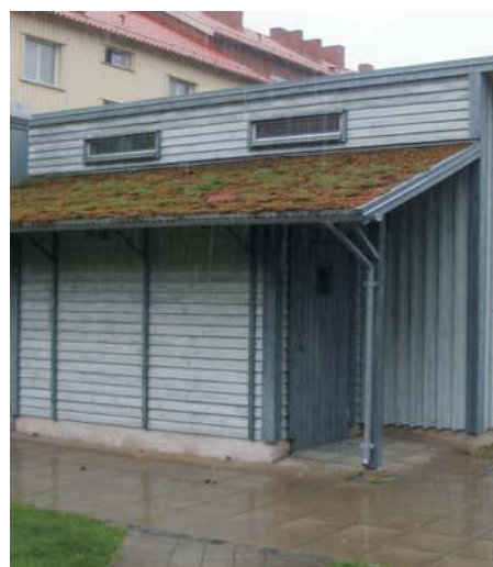
Figure 2 A small extensive green roof in Malmo, Sweden

The SuDS components outlined are often considered to be easy to adopt on new build developments, but delivering SuDS into urban areas can be more difficult. Retrofitting SuDS to manage surface water issues has become an important issue. Local authorities in particular, and following the establishment of the Flood and Water Management Act, have a lead role in managing local flood risk.