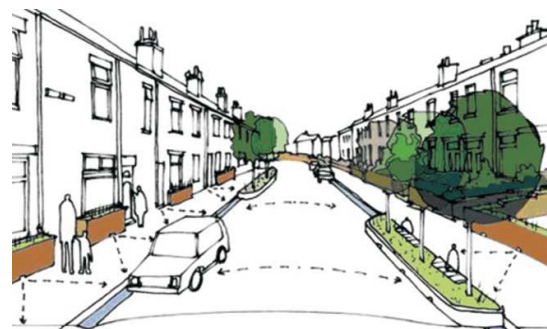
Figure 5 Example of a potential SuDS retrofit on a terraced street

CIRIA also provide training courses, either in-house or externally on SuDS. For more information go to: www.ciria.org.uk/suds/forthcoming_events.htm