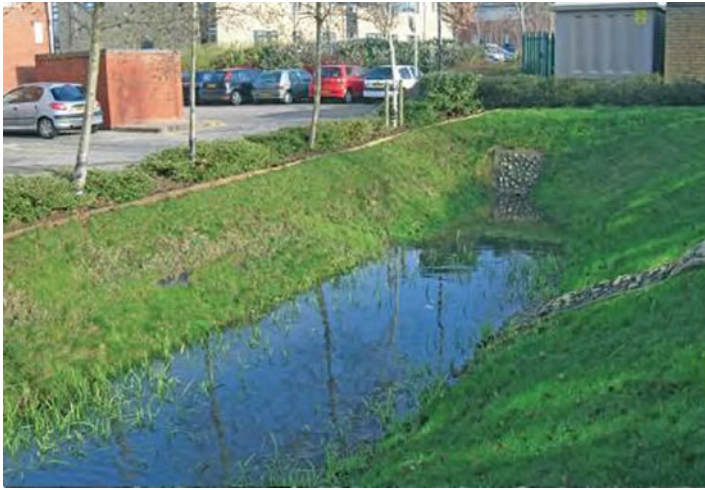
Benefits and achievements

Enables development of constrained sites as requires minimal loss of land.