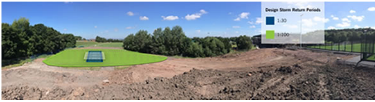
Figure 2. Looking out toward the proposed attenuation area

required shallow excavation and facilitated re-use of site spoil that would have necessitated off-site disposal. This design then communicates to a much larger surface area enabling the management of drainage exceedance caused by rare events.