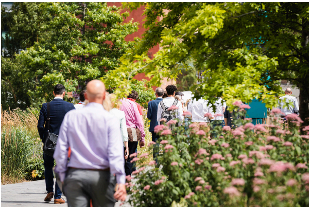
2023 susdrain SuDS Awards

With your support, CIRIA's independence, and our combined knowledge and passion we will continue to celebrate SuDS and ensure high quality SuDS schemes are delivered across the UK and beyond.