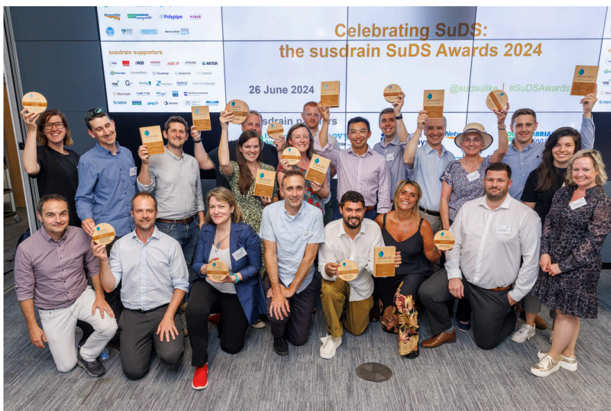
2024 susdrain SuDS Awards winners and highly commended