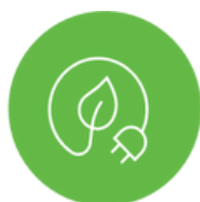
Achieving Net Zero Carbon